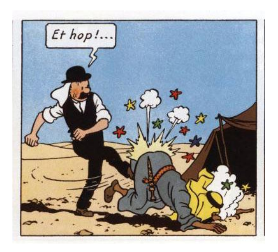
Fig.4. Vignette 22C2 of Au Pays de l'or noir.

In the second scene, the two detectives, asleep at the wheel, drive through the wall of a mosque thereby disrupting prayer. The first of these two scenes was added to the story only in its latest version, and was absent from the Petit Vingtième and first coloured edition of 1948. It was also omitted from the animated series. The second scene, where the two detectives drive through the wall of a mosque, was part of all three versions of the story.