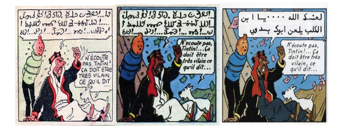
Fig.2. the same scene in three versions of Au Pays de l'or noir. Left to right, the 1939 version from Le Petit vingtième, the 1948 version, and the current version as it has been since 1969. Of all these, only the latter shows actual Arabic. The character of Bab el Ehr is saying "Goddamn you.... son of a dog damn your father Bedouin."

final version of the story in 1969. Besides changing the setting to the fictional country of Khemed and making some updates that include replacing members of the British colonial police with Arab officers, Hergé also replaced the squiggly lines that were meant to be Arabic with actual Arabic script.