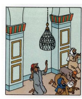
Fig.5. The same scene in three versions of Au Pays de l'or noir . Left to right, the1939 version, the 1948 version, and the current version as it has been since 1969. Of all these, only the 1939 shows correct gestures of Islamic prayer.

For this reason, the possibility of an uncensored Arabic edition of Au Pays de l'or noir is extremely unlikely. Even if we do without ideological considerations, and look at the question from a purely economic perspective, non-Muslim Arabic-speaking markets remain relatively narrow, and do not justify translating the story and releasing it as is.