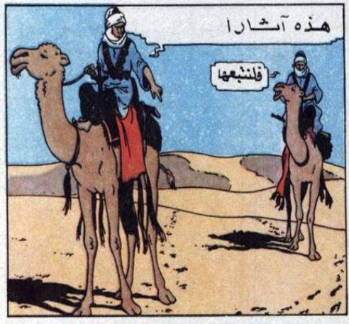
Fig.1. Vignette 32B2 of Le Crabe aux pinces d'or . To the left, the original shows the pseudo-Arabic. To the right, the Arabic version replaces the squiggly lines with actual Arabic (the characters were made to say "These are tracks/Let's follow them")

Adaptation and correction are not limited to this adventure. Hergé updated many other albums. When it comes to the stories of Tintin in the Arab World, none went through as many changes as Au Pays de l'or noir . Indeed, it has one of the most tumultuous histories in the entire Tintin canon. The story was first published in serialized form in the journal Le Petit vingtième in 1939, as were all of Tintin's stories up to that time. However, publication of Le Petit vingtième was interrupted due to World War II, and the story was never completed. In 1948, Hergé restarted the story in Le Journal de Tintin . Six other adventures had been published in the meantime. In both of these versions, the setting is The British Mandate of Palestine. By the late sixties, the story had become anachronistic, not only due to this location, but also because of the involvement of an unnamed Jewish terrorist group modelled after the Irgun (Assouline 278). So Hergé brought more modifications, making a third and