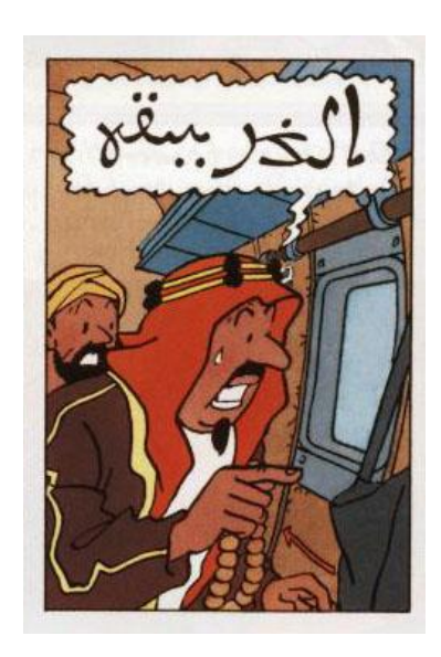
Fig.3. Vignette 17C3 of Coke en stock.

In the panel in figure 3, for instance, the reader who knows Arabic is easily able to see that the intended word is [Fire!], and it is consistent with the plot (the character has just spotted a flame). However, the letters are traced incorrectly. For example, the letter \tau does not connect to the letters that precede and follow it as it should, and includes a dot transforming it into a \dot{\tau} ; also, the letter \dot{\varphi} in this position should be written in its initial form \dot{\varphi} rather than the medial form used here. This makes the Arabic in Coke en stock , despite its being the latest adventure set in the Arab World, halfway between An Pays de l'or noir where the Arabic is very accurate and Le Crabe aux pinces d'or where nonsensical squiggles stand in for Arabic.