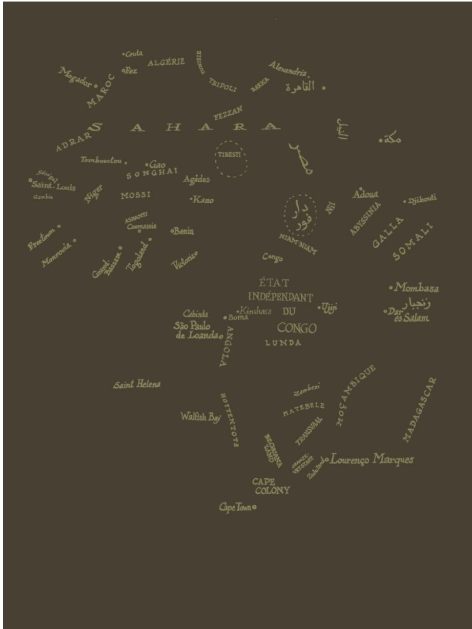
© Futuropolis / Dist. LA COLLECTION Jean-Philippe Stassen, « Cœurs des ténèbres »