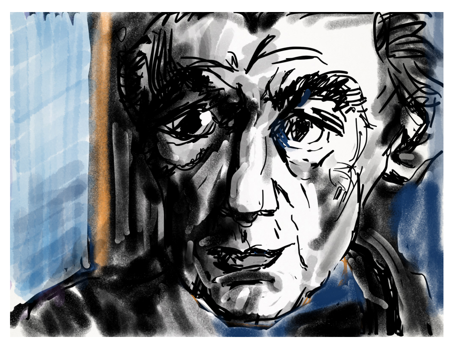
Figure 2. iPad painting, scalable