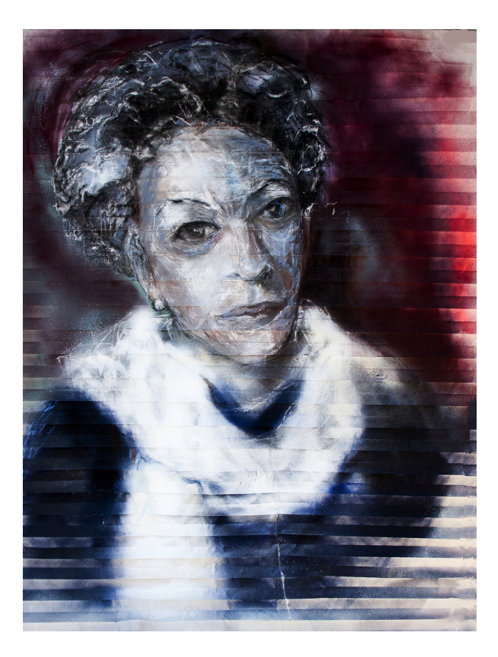
Figure 3. The Novelist, Arrived, spray-paint/pastel on paper pleated screen, 48"w x 72"h