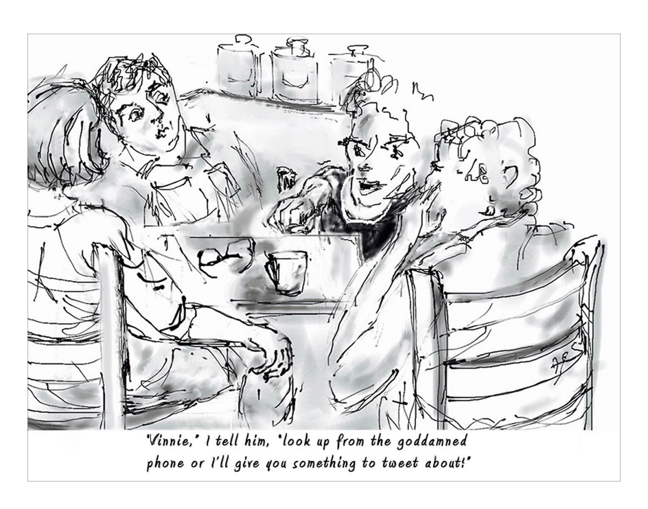
Figure 1. iPad drawing, scalable