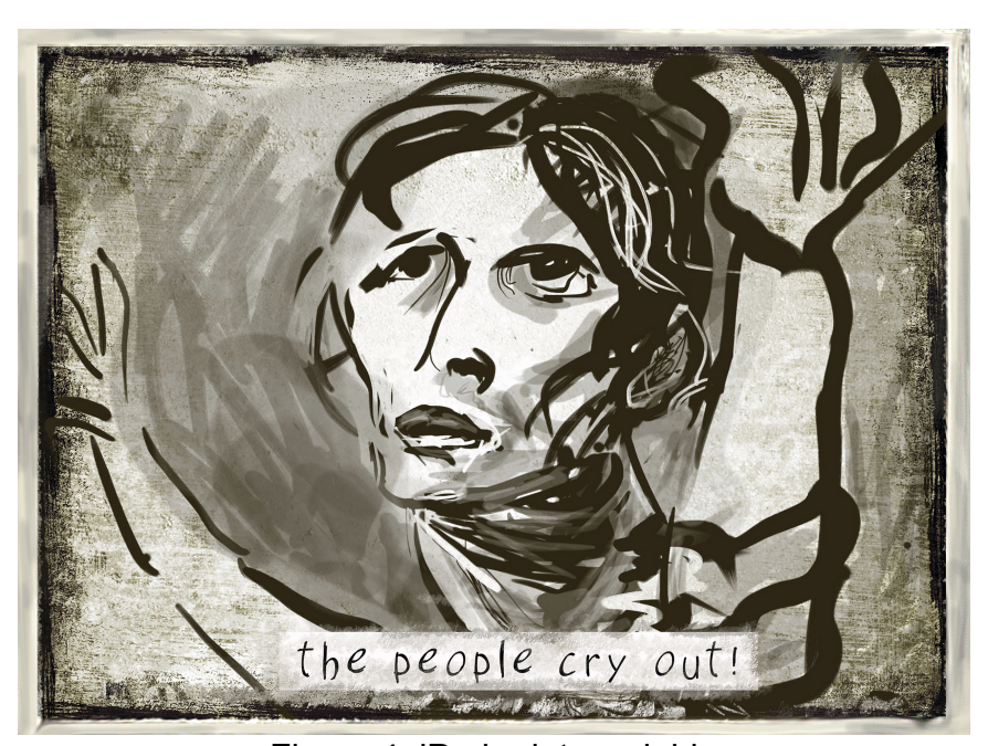
Figure 4. iPad print, scalable

They sometimes die there too. Capsize. In my '20s, it was the Boomer generation, the Vietnam war, the women's movement, the civil rights movement, mind drugs. When I really turned around and said, "Now I'm going to be a poet," I thought uh-oh, I can live to write and I bet I'll be addicted because I'm trying to live always in that altered state of mind. I was basically a good little girl who needed help to get into an altered state. I made a choice: I'm not going to live to write. I'm going to write and live—so that I'm still alive at 40. There were art and music heroes of my generation like Jimmy Hendrix, Janis Joplin. They were pioneers of that generation and they died young. The poets, Sylvia Plath, Anne Sexton, Theodore Roethke—died before their time.