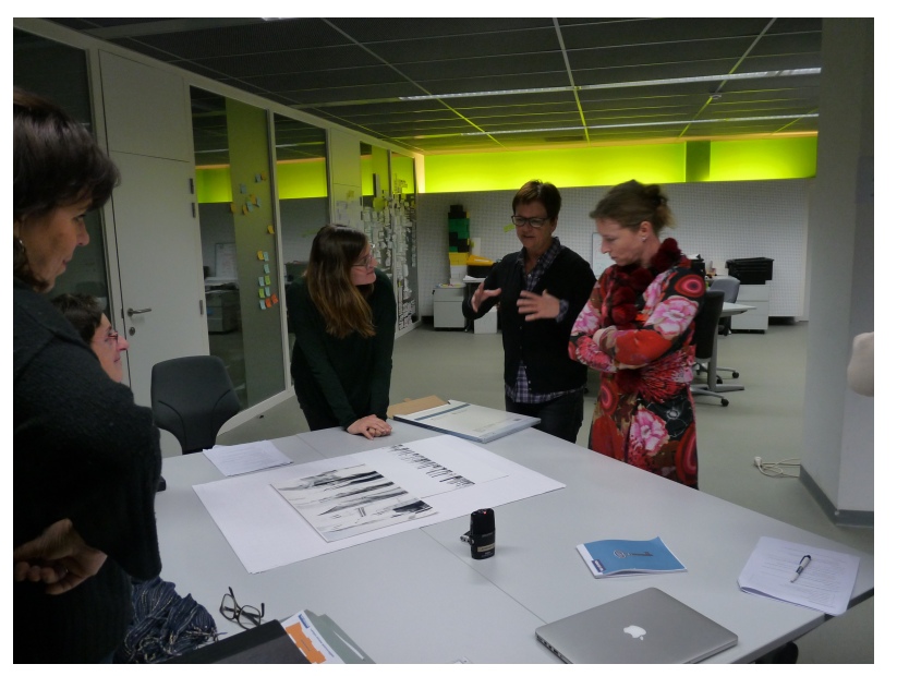
Figure 4. Collaborative process.

In the context of this study, art students were invited to make a work of art based upon their experiences of the walk, in close collaboration with the researchers. Art students were involved as co-researchers in the process, whereby the act of creating was simultaneously the act of researching the urban renewal area (Wang, Coemans, Siegesmund, & Hannes, 2017). Art students and researchers gathered multiple times to discuss sensory scholarship, to talk about their walking experiences. and to share interview transcripts, preliminary sketches, and images (see Figure 4).