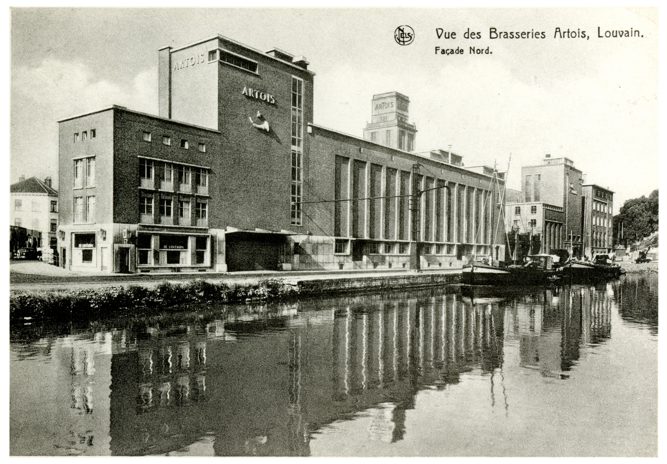
Figure 1. The old industrial site.

Because of its shallow waterways, competition of road transport, and changing economic activities, the area went into decline. In 2008, the city proposed plans to transform the area into a fully renovated urban district. Since then, everyday life in this area has been characterized by on-going building work. A combination of private homes, social rental and owner-occupied homes, starter, and student homes has currently been built to create a new vibrant, sustainable, environment by the water. What used to be an abandoned part of the city is now turning into a creative and cultural hub "where designers, starters, artists, production companies, cultural associations and craftsmen have a place to stay in affordable spaces ….." (website city of Leuven, https:// www.leuven.be/vaartkom). It has the mission to "create" an urban neighborhood or community by connecting different people within one particular area, an idea that has received much attention under the impulse of the "micro-urbanism" movement promoting "the design and development of small-scale, distinctive neighborhoods and settlements, recreating a small version of a city" (Mandanipour, 2001, p. 172).