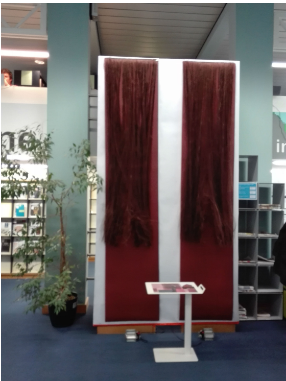
Installation, Monik Myle

Figure 5 . Series of art works created in the context of the research.