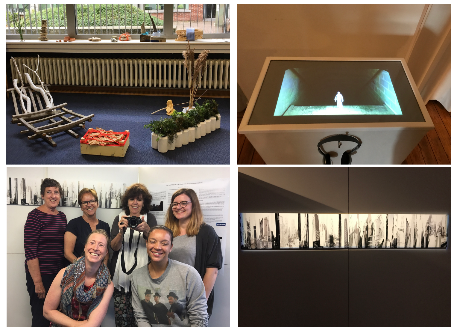
Figure 6. Expositions.

The students also shared experiences using a blog to post links, memos, background information, photos of the neighborhood or photos of their work in process. With the making of these art works, we not only aimed to record data (in terms of collecting visuals and other sensory materials that represent the neighborhood in flux) but we tend to make data from an embodied engagement with the sensory qualities of the world (Cahnmann-Taylor & Siegesmund, 2018). As such, the art works made in the context of the study were used to generate new data. These data can be considered as narratives of place experiences, narratives that are not verbal but that can "take many forms, depending on the individuals involved and the contexts they derive from " (Cele, 2006, p. 14). Depending on the student's artistic background, several creations were made, including photographic work, a video made out of still images, installations made out of recycled materials, paintings and drawings (see Figure 5 ).