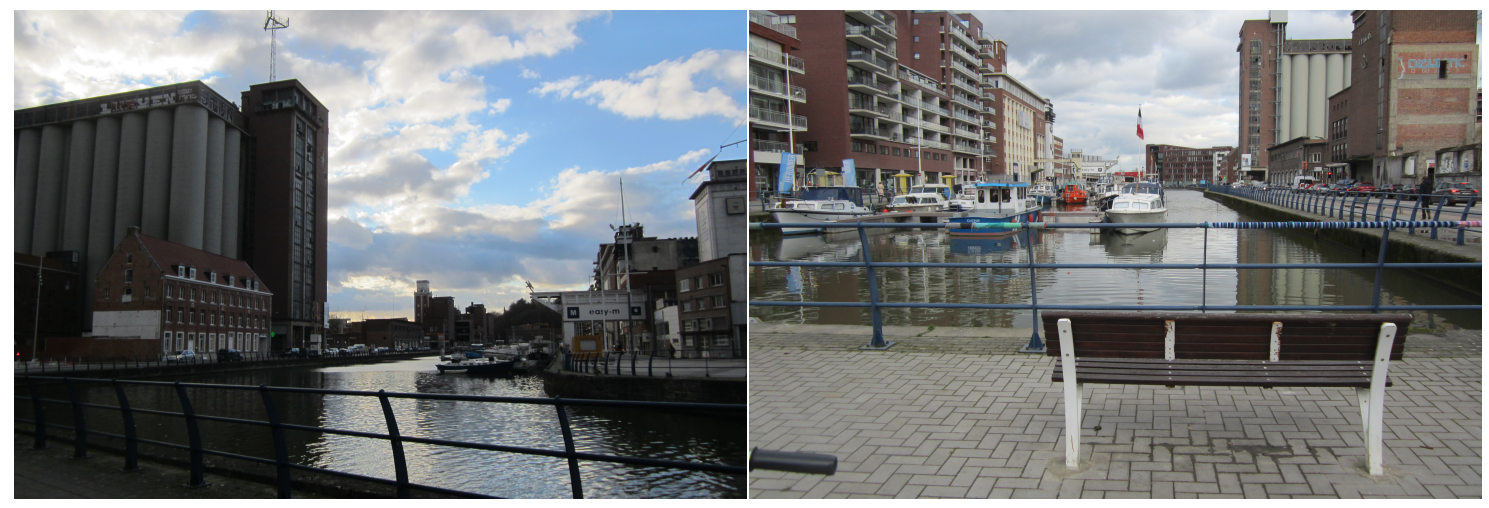
Figure 2. Canal Bowl anno 2017.