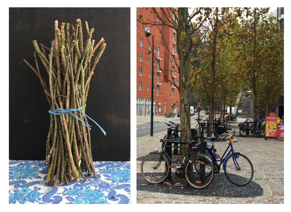
Figure 10. Visual image pair.

In the process of making the art work, several small creations were made that can be linked to particular locations she photographed. Christiane designed "visual image pairs" (Marin-Viadel, Roldan, Genet, & Whiston Spirn, 2015) that are composed of two images: the initial photograph taken at a specific location (the left picture as illustrated in Figure 10 ) and the photograph of her creation inspired by that particular location (the right picture as illustrated in Figure 10 ). They are joined to one another to construct an argumentation based on her sensorial experiences. Below we discuss one of the visual image pairs that was part of the installation in more detail (Table 3).