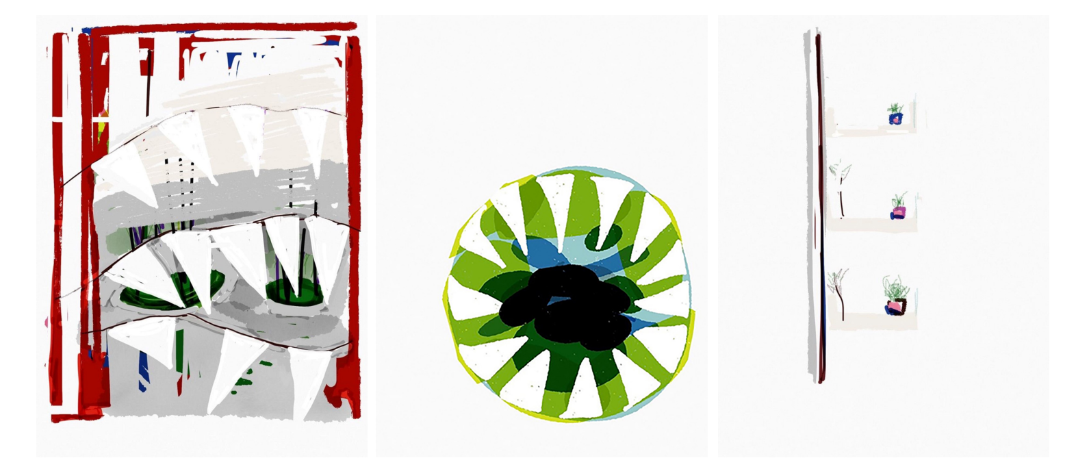
Figure 8. Sketches.

"A new order." Christiane made multiple walks in the area. These strolls became searches for order in chaos, the chaos in the Canal Bowl area, as she stated: "The area underwent and undergoes changes, the area is in full transformation, with chaos as a result; rubble, buildings, familiar images that are disappearing, new greenery that still has to grow... How do we relate to those changes? How can we look at a neighborhood in change?" Specific spots caught her attention and triggered emotions or memories that she captured in images. In the artistic process, she intra-actively engaged with her photographs. Sketches (see Figure 8 ) were created that changed the essence of the original images through the use of compositional elements: amplification of colors, manipulation of size, intensity, tracing contours, replacement of elements (Hannes, 2018)