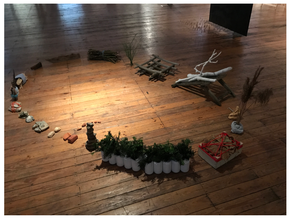
Figure 9. A new order.