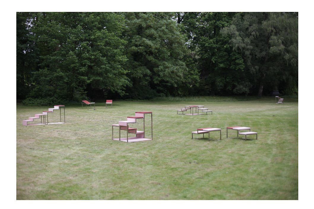
Figure 3. Scenes (jardin) 2016