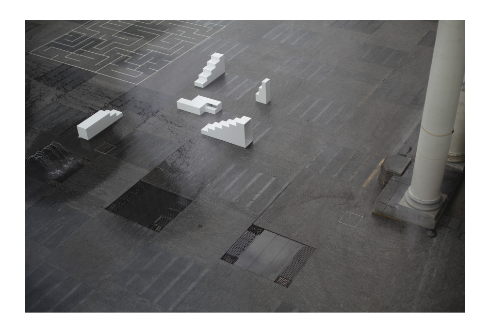
Figure 1. Scenes (cour jardin) 2015

In 2015, Belgian visual artist and designer Karel Verhoeven (°1982, Ghent) realized the first setup of the series "Scenes (cour jardin)": five white modules made of wood, each incorporating staircases ranging from two to six steps. This review will focus on the ongoing project series "Scenes (cour jardin)" which has travelled across Belgium ever since.