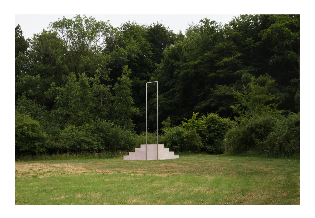
Figure 4. Scenes (jardin) Poperinge 2017

Different versions of "Scenes" exist, and each new production includes more modules that become more diverse in nature. For every new assignment, the design concept is adapted to the spatial environment proposed by the commissioner; what existed before is appropriated and extended to function in the new environment. All installations were placed in (semi)public spaces, inviting citizens into playful engagement with the installation. Some of Verhoeven's "Scenes" are permanent, some were temporary. The modules are grafted onto architectural materials and typologies we find in our shared daily environment such as blocks, stairways, seats, benches, tribunes, platforms, stages and pedestals. By playing with level differences, the modules connect the earthly with the unearthly, and are a way of both framing and carrying the spatiality of a place. Throughout the process of making "Scenes" Verhoeven has had to balance the projects' autonomous aesthetic qualities and their functionalities. The variable use of materials is of course informed by technical, financial, site-specific and other practical realities, but also presents an opportunity for the artist to experiment with and learn about the relationship between form, material and environment.