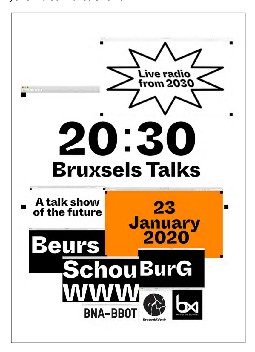
Figure 1 Flyer of 20:30 Bruxsels Talks

experimenting with the design of future situations to "bridge between abstract notions of possible futures, and life as it is apprehended in the present and on the ground" (Candy and Dunagan 2017, 137). Designing and staging "fictive interventions" like the radio show presented in this article, can help connect people with futures in deeper, more visceral, more emotionally resonant ways or even engage people in conversations on futures, who otherwise would not feel comfortable with the topic. These conversations are not only about what might happen in the future. Futures thinking is mostly about what we would like to happen, and how we can make it happen (Ramos 2017). "At the most general level, the goal of futurists is to contribute toward making the world a better place in which to live, benefitting people and the life-sustaining capacities of the Earth" (Bell 2009, 73).