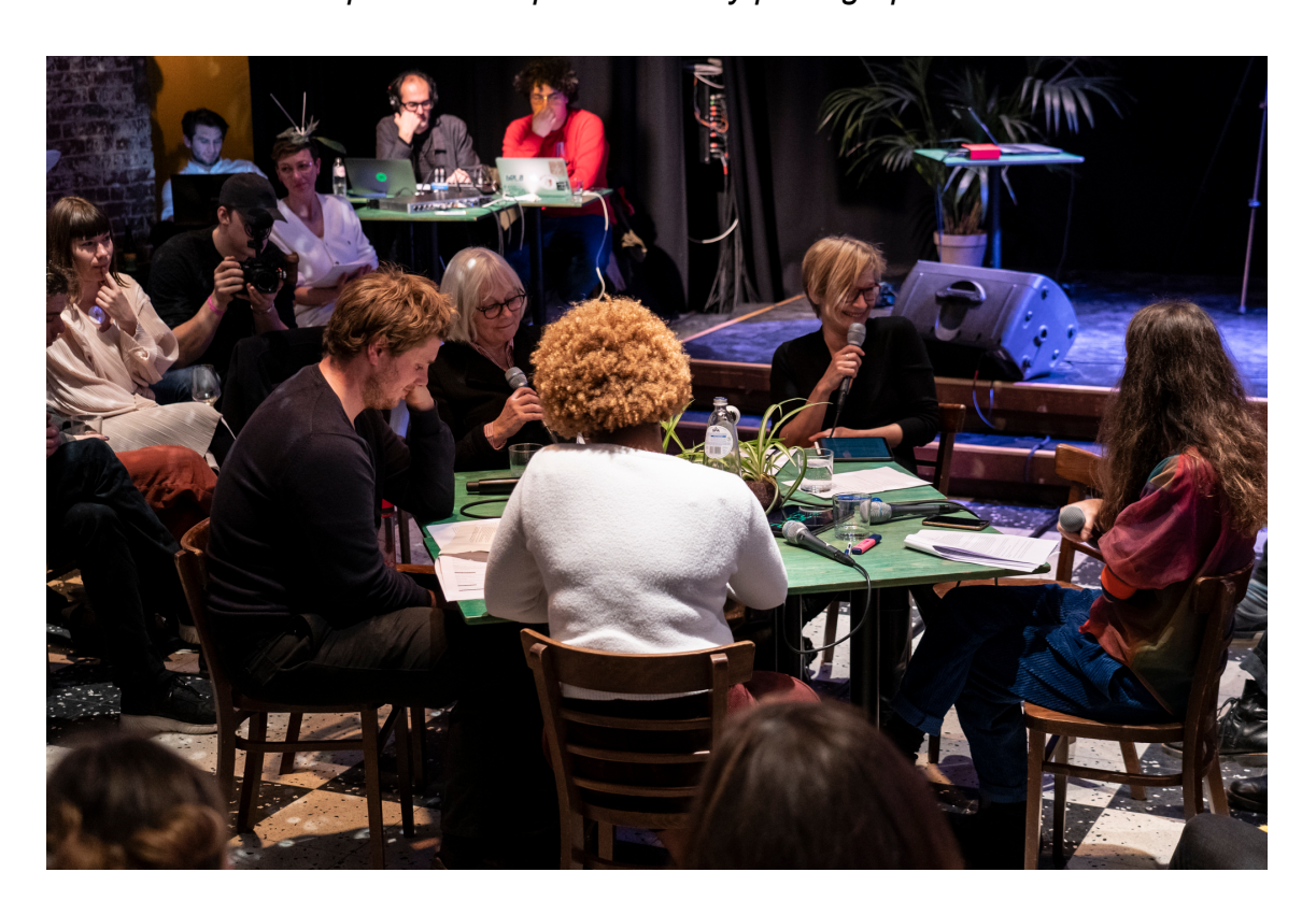
Figure 4 Panel discussion.

12'00: first debate and in-between open mics (see Figure 4)