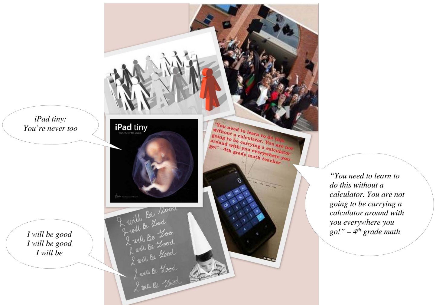
Figure 1. Lara's visual collage

The difference that Lara perceived (and seemed to desire) was what Deleuze described as "difference in itself", or, "the particularity or 'singularity' of each individual thing, moment, perception or conception" (Stagoll, 2010, p. 74). That is, Lara was not defining her way of being as 'different from' the others, nor was it her perception that they were excluding her. Rather, her desired way of being an educator was to have the capacity to move and to change, or, to work in micropolitical ways.