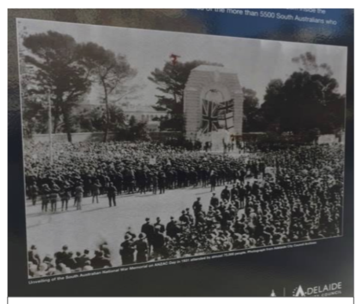
Figure 1: An image on a plaque that sits alongside the South Australian National War Memorial in Adelaide, Australia. The image shows crowds at the memorial's unveiling on ANZAC Day, 1931.

A nearby plaque bears an image captured at the memorial's unveiling, which was attended by 75,000 people. Clearly, such an occasion breaks with the banality of regular routine. With the memorial at the centre of their attention, these people would have consciously engaged with the narrative of the past that the memorial seeks to promote. This is a classic example of the overt shaping of a people's collective memory.