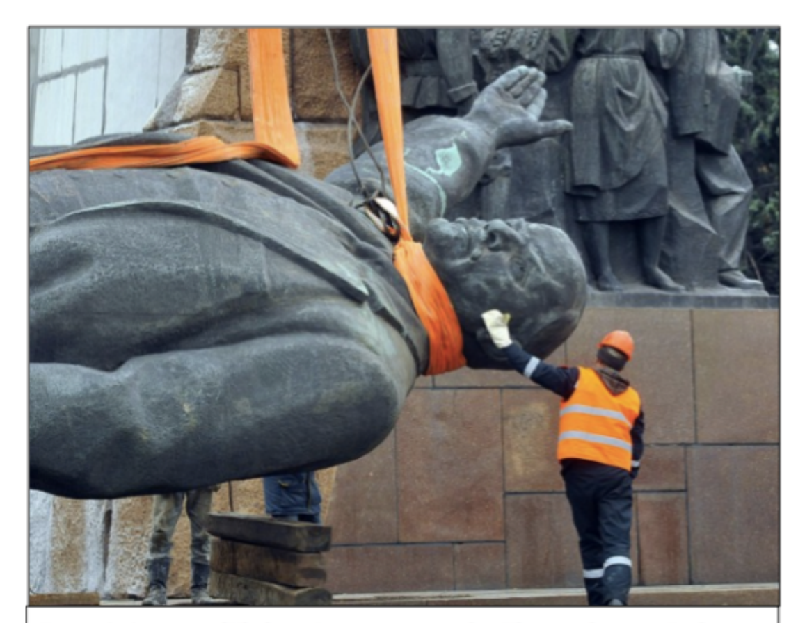
Figure 3: A statue of Vladimir Lenin is removed in Ukraine.

However, such attempts to create a homogenous, one-dimensional narrative of a nation's history are doomed to failure. In eastern Ukraine, crowds of civilians have turned out to defend statues of Lenin, and in some cases have prevented their demolition.<sup>32</sup> In Adelaide, the South Australian National War Memorial will continue to induce national pride "not at all" for a noteworthy percentage of commuters. In Azerbaijan, many students will eventually be exposed to foreign perspectives regarding the history of their nation's conflict with Armenia. And in New Zealand, some will continue to demand that Captain Cook be removed from his pedestal. Despite how entrenched a given narrative appears, it inevitably co-exists with alternative narratives. And, despite how deeply these alternative narratives may be pushed underground, they always remain capable of bursting to the surface. Clearly, in no society does there actually exist a unitary collective memory.