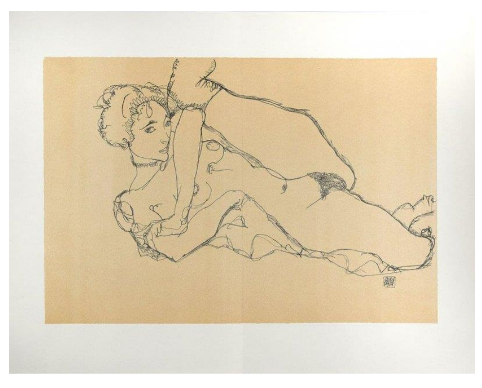
Figure 12. Egon Schiele, Reclining Nude with Left Leg Raised (1914).