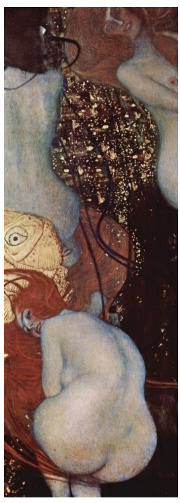
Figure 1. Gustav Klimt, Goldfish (1902)