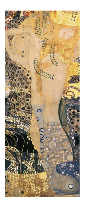
Figure 8. Klimt, Watersnakes I (1904).