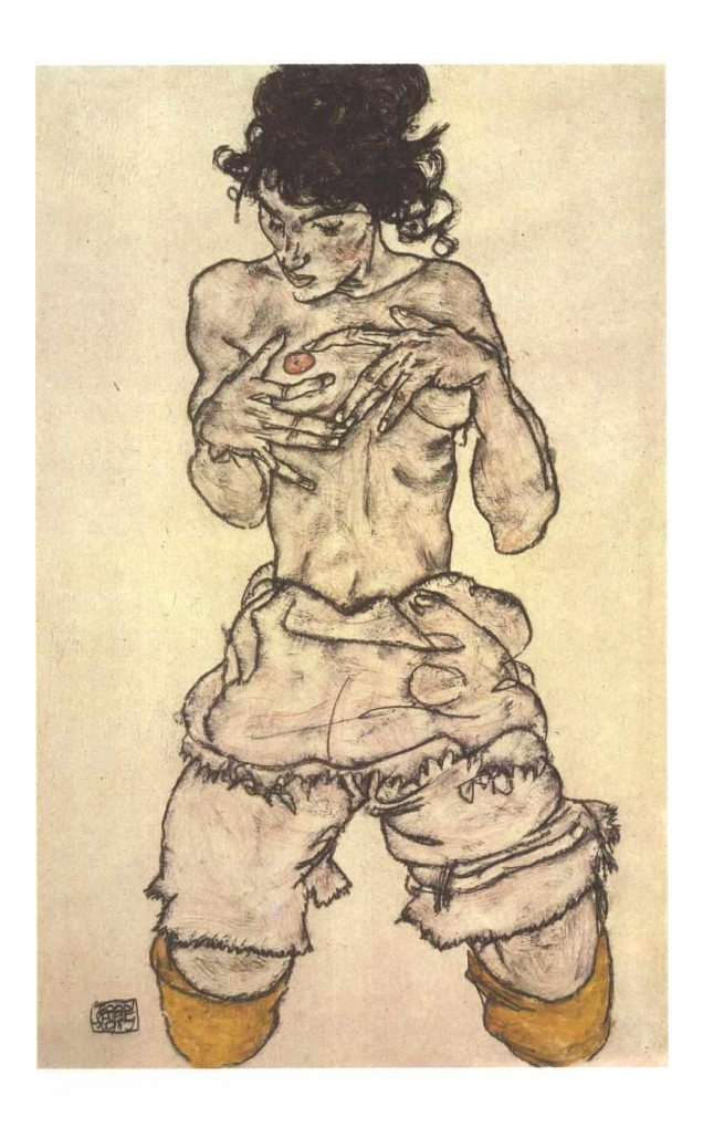
Figure 13. Schiele, Kneeling Seminude (1917).