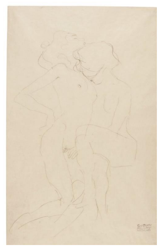
Figure 3. Klimt, Girlfriends (1913).