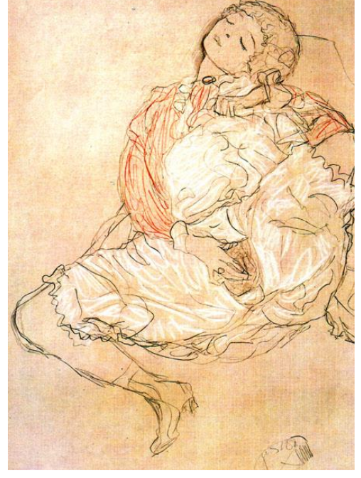
Figure 5. Klimt, Seated Woman with Open Legs (1916/17).