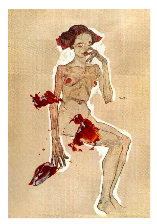
Figure 15. Schiele, Seated Nude Girl (1910).