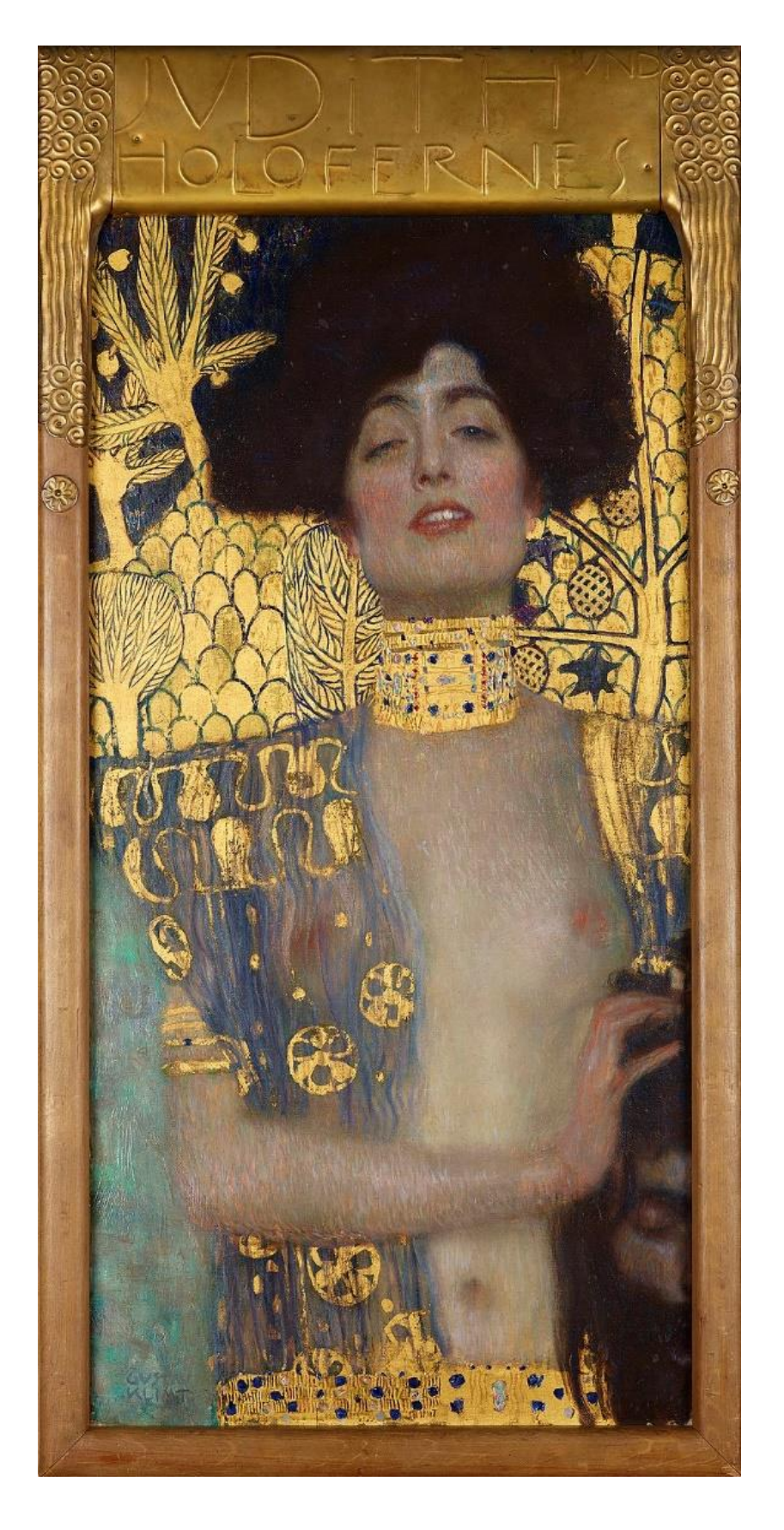
Figure 11. Klimt, Judith with the Head of Holofernes (1901).