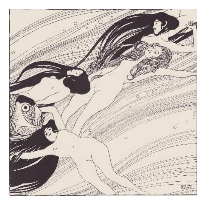
Figure 7. Klimt, Fish Blood (1898).