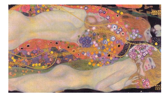
Figure 9. Klimt, Watersnakes II (1904).