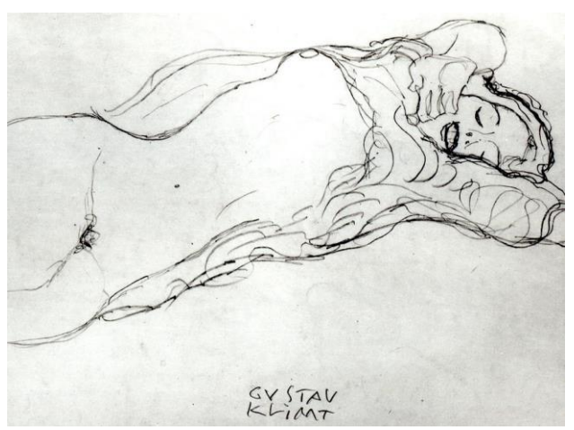
Figure 6. Klimt, Reclining Woman (1914).