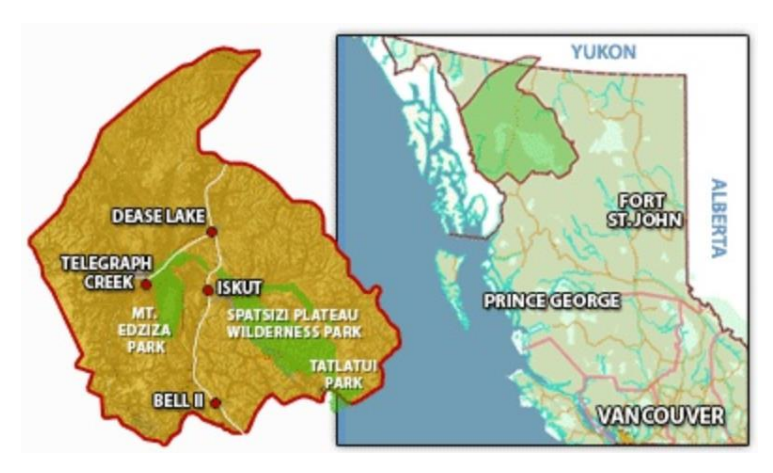
Figure 1. Map of Tahltan Communities (Łuwechōn - Iskut, Tātl'ah - Dease Lake, Tlēgo'īn - Telegraph Creek) and Territory in British Columbia

There are three Tahltan communities: Łuwechōn (Iskut), Tātl'ah (Dease Lake), and Tlēgo'īn (Telegraph Creek). The driving distance between Łuwechōn and Tātl'ah is 84 km and between Tātl'ah and Tlēgo'īn, 108 km.