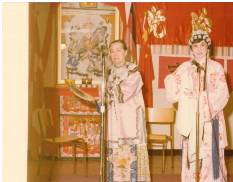
Figure 4. Cantonese opera performance in the 1970s, Toronto.