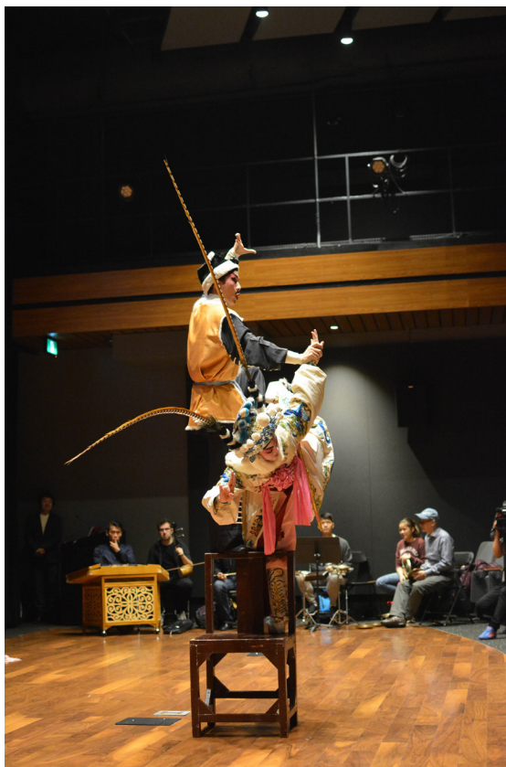
Figure 5. Cantonese opera demonstration and seminar, 2016.