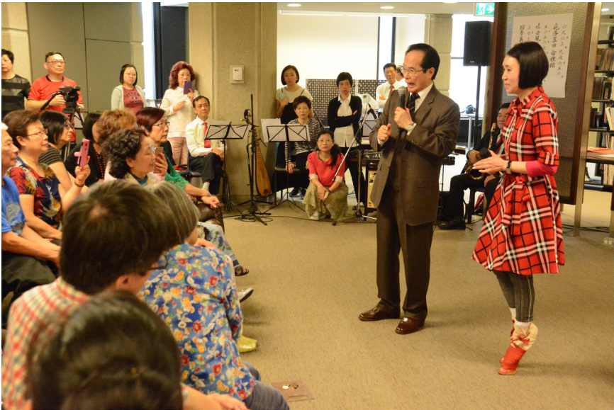
Figure 6. Cantonese opera music demonstration and seminar, 2017.