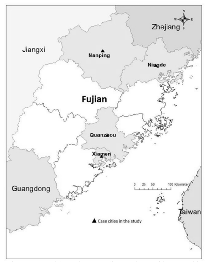
Figure 2. Map of the study area: Fujian province and four case cities.

migration in China. Another reason to select Fujian was its representativeness in migrant labour market studies. As a coastal province, Fujian has been at the forefront of adopting economic reforms and open-door policies. As part of the eastern China economic belt, Fujian connects the two most important economic centers of the Pearl River delta in the south and the Yangtze River delta in the north. Its economy is also heavily influenced by overseas investment, especially from Taiwan. The impressive pace of economic growth over the last three decades has created substantial employment opportunities in urban Fujian that cannot be filled by local labourers. Numerous rural migrants are employed in manufacturing and service sectors from its urban centers to its urbanizing countryside.