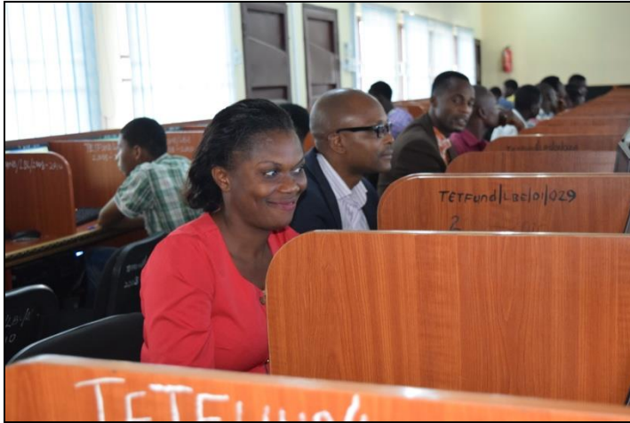
Figure 3 Staff and students accessing the Internet at the FUPRE e-library.