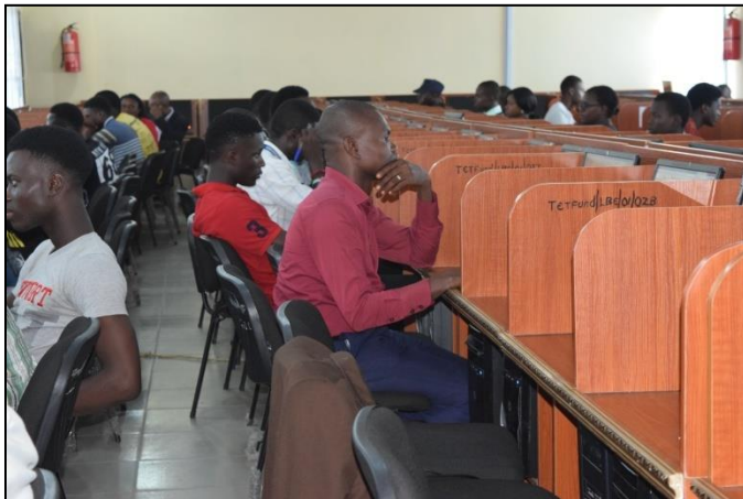
Figure 4 Students browsing the Internet at the FUPRE e-library.