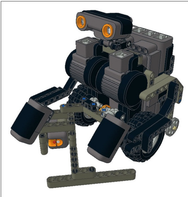
FIG. 1. Arturito, the brick-sorting Lego NXT robot.

The second level of its architecture uses the ultrasonic sensor to avoid obstacles. When the ultrasonic detects that an obstacle is closer than a safe threshold, motor