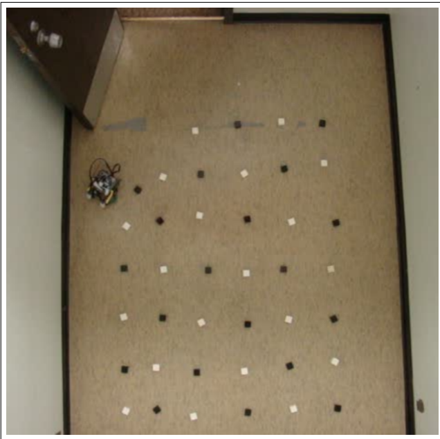
FIG. 2. An example starting state for robot sorting.

were very successful. First, the robot turned to a detected brick as if it was looking for it; this behavior was far more effective than that observed in the Lemming. After scooping up a brick in its plow, it typically drove itself to a nearby wall, ignoring the presence of other bricks along its way. Finally, it turned away from the wall, depositing the brick that it carried. Second, brick sorting behavior was much faster than that seen in the Lemming. After only about 10-15 minutes, Arturito had pushed all of the white bricks near a wall, leaving the centre of the arena empty, as shown in Figure 3.