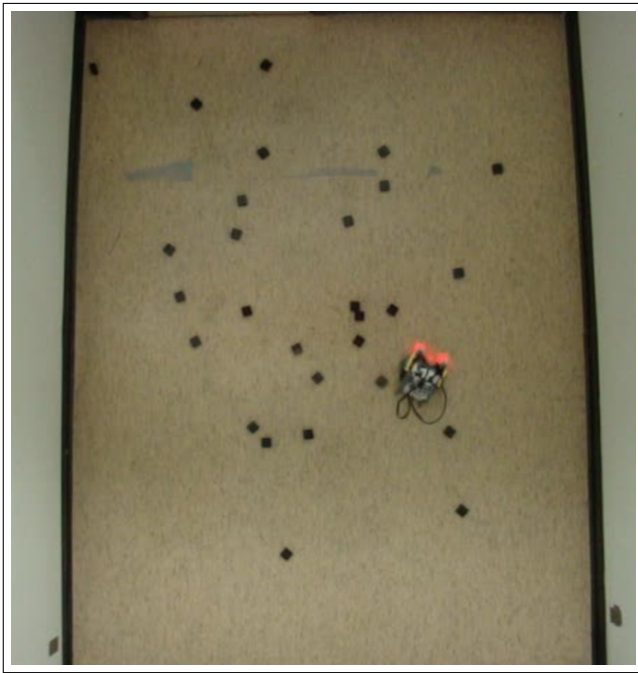
FIG. 4. Arturito leaves black bricks in the middle of the arena.