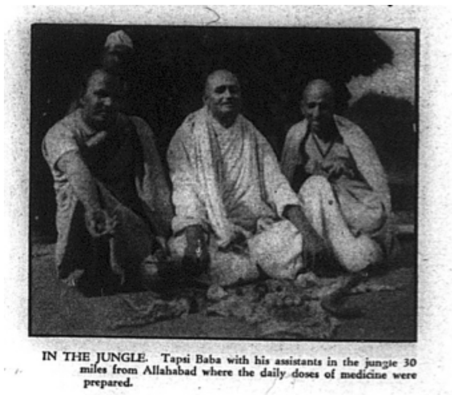
Figure 2: Tapasviji with his assistants for the Malaviya treatment as appeared in The Illustrated Weekly of India in Lal 1938.

Swami was primarily offering treatments in Colombo, Ceylon (Sri Lanka) which offered rejuvenation for more modest commitments of time and money than Malaviya's more famous example. However, the existing documents do not make it clear if Anandaswami was primarily an ascetic who later set himself up as a physician, or if he was first trained in Ayurveda, studied further rejuvenation techniques under Tapasviji, and then established his own business on the back of Malaviya's well-publicised success. 64