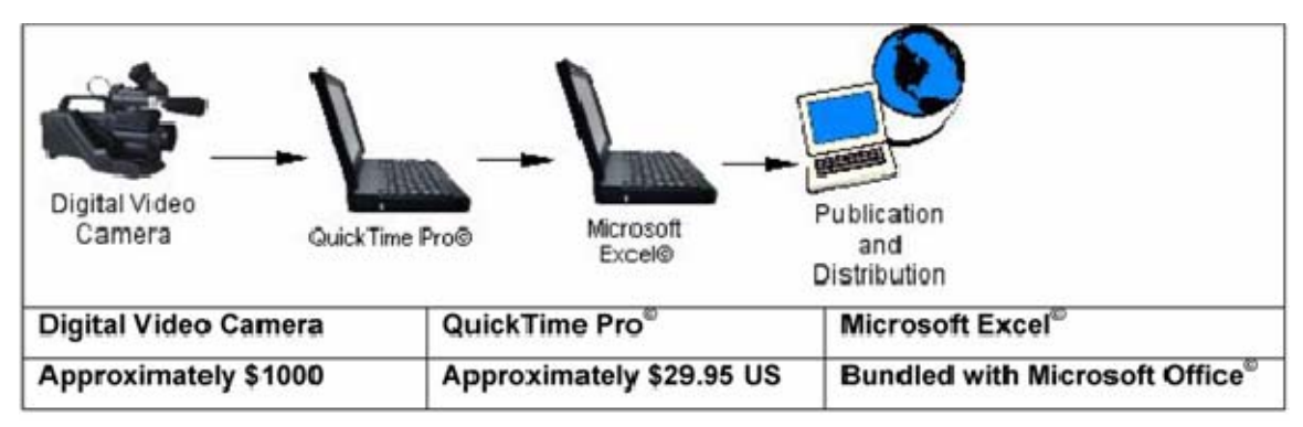
Figure 3. Case Study 2, original method

Treatment of the audio was slightly different from that in the first case study. Based on the experience reported in Case Study 1, we decided to explore the possibility of using just QuickTime Pro rather than Final Cut Express. QuickTime Pro provided the functionality required to cut the audio files into manageable clips. However, it also required that we first import the audio files into iMOVIE to convert them into QuickTime movies, a format easily imported into QuickTime Pro. The advantages to this change include our not needing to learn Final Cut Express, the size of the audio files, and the ease of use of QuickTime Pro (Figure 3).