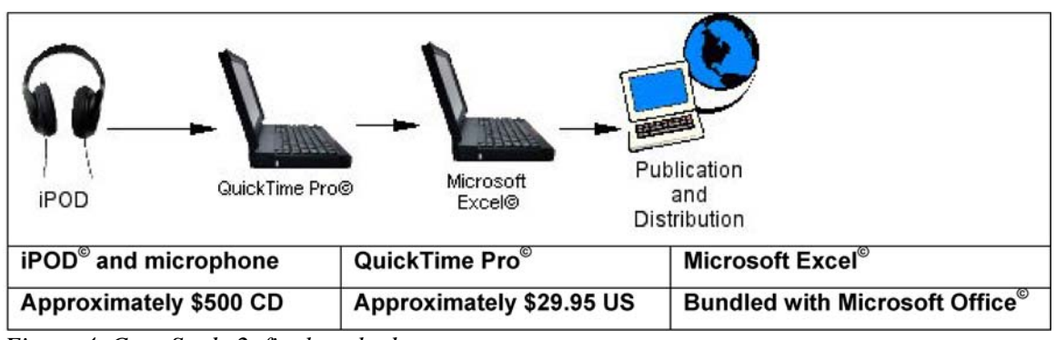
Figure 4. Case Study 2, final method

A further simplification of the process came with the use of an iPOD with a microphone attachment (Figure 4). The iPOD replaced the video camera, and participants seemed less threatened by it. It still appears that some participants view a video camera as intrusive, and they can be self-conscious while it is running, even though eventually they do seem to forget that it is there. Files exported from the iPOD can be imported directly into QuickTime Pro, which saves the time of importing and exporting through iMOVIE. It also reduces the demand on hard drive space.