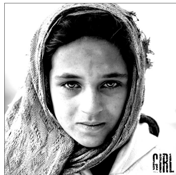
Figures 10, 11, 12 & 13. Still X Strong album covers, clockwise from top left: Demo (2007), Split (2008), Cornerstone (2011), and Girl (2012).

to veganism and straight edge life choices, but the changes on the covers suggest a fractured visual identity, highlighting the fact that straight edge iconography is not always visible or obvious, but sometimes hidden (from the surface at least).