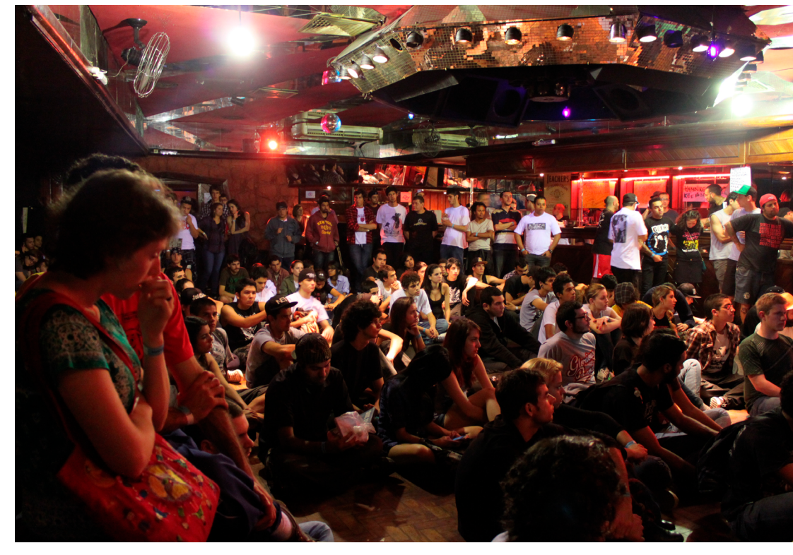
Figure 18. One of the few women I spotted in the mosh pit.