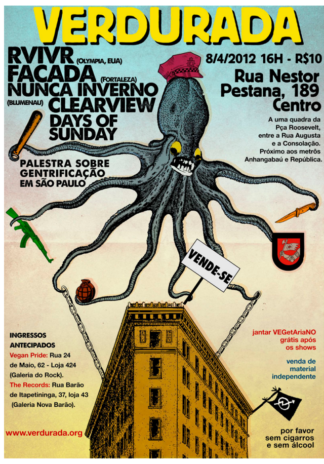
Figures. 1 & 2. Verdurada poster from June 1998 (left) showing an image related to the debate about gentrification in Sao Paulo. Another from April 2012 (right): the sign held by the octopus reads "Vende-se" ("For sale"), affixed to a historical building.