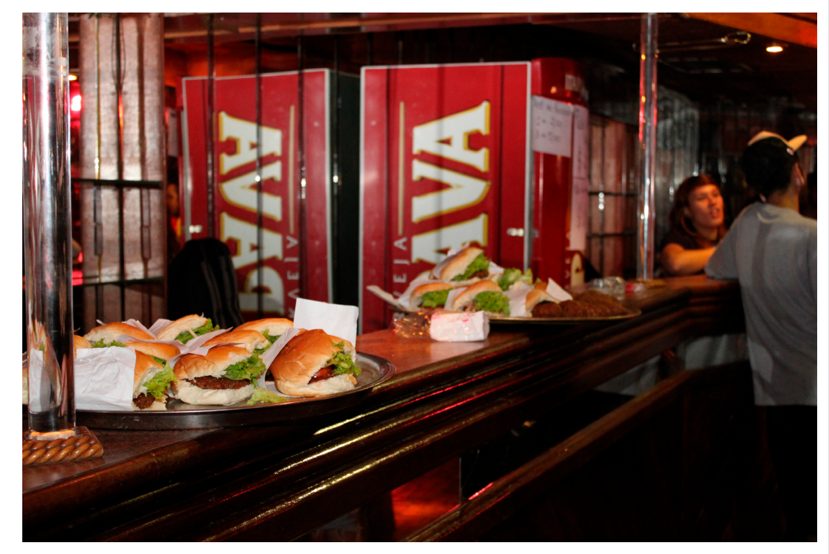
Figure 16. The bar at a Verdurada event, filled with water, Mupy, and vegan food.