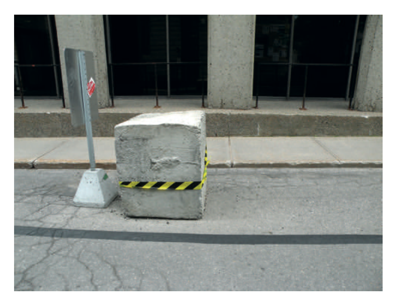
Tom McGlynn. Montreal (McGill) block and sign, 2015.