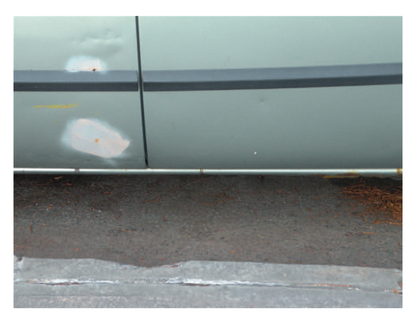
Tom McGlynn. NYC car with body spot, 2015.