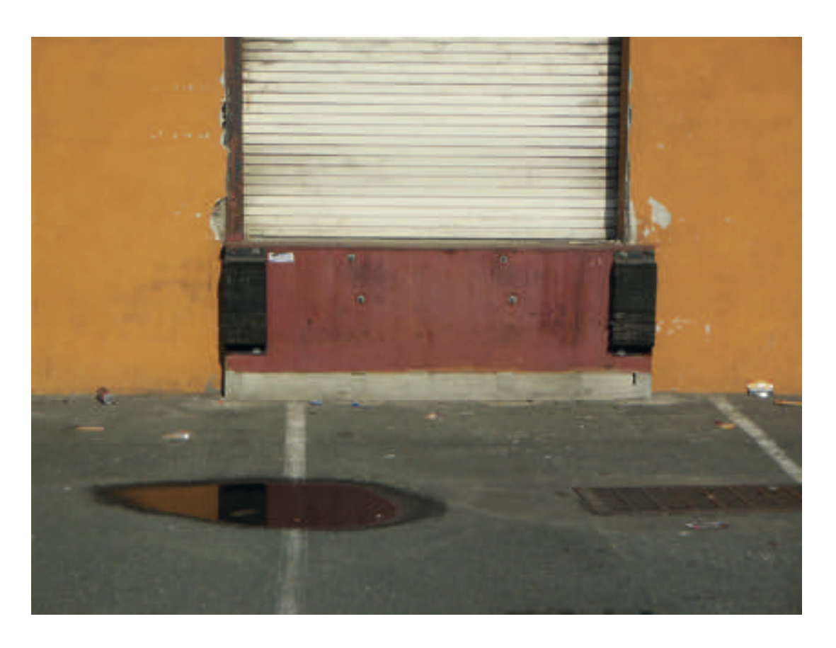
Tom McGlynn. yellow loading dock, New Jersey, 2015.