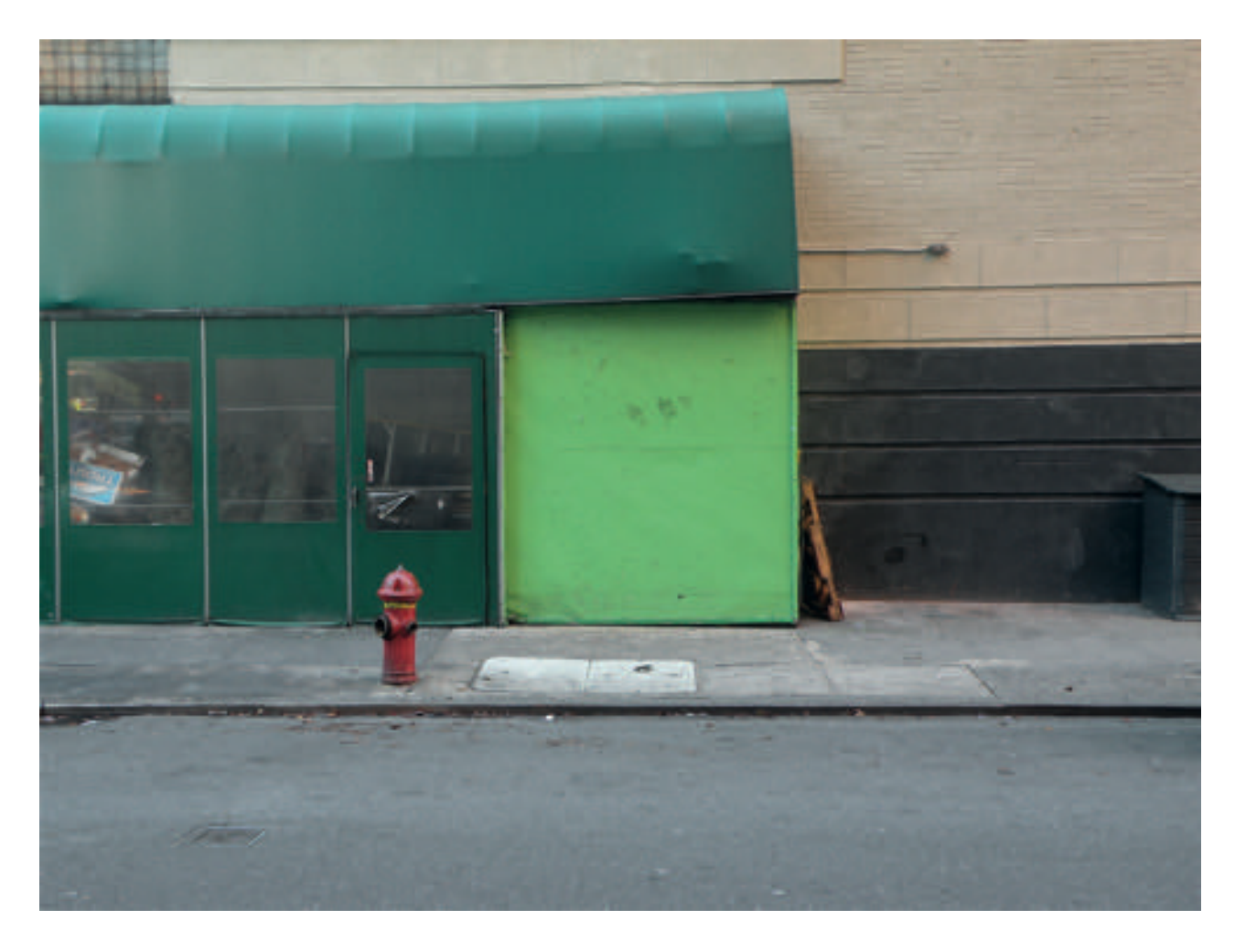
Tom McGlynn. Lower East Side grocery awning, NYC, 2015.