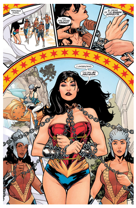
Figure 2. Wonder Woman restrained with chains in the Wonder Woman: Earth One series. Grant Morrison (w) and Yanick Paquette (a), Wonder Woman: Earth One (April 2016), DC Comics; Richard Guion, "Wonder Woman- Yanick Paquette," Flickr, 1 April 2016, www.flickr. com/, accessed 31 July 2018.

playing on Wonder Woman's status as a feminist figure and its potential negative consequences (130). For Wonder Woman, consumerism dilutes the strength of her feminist message.