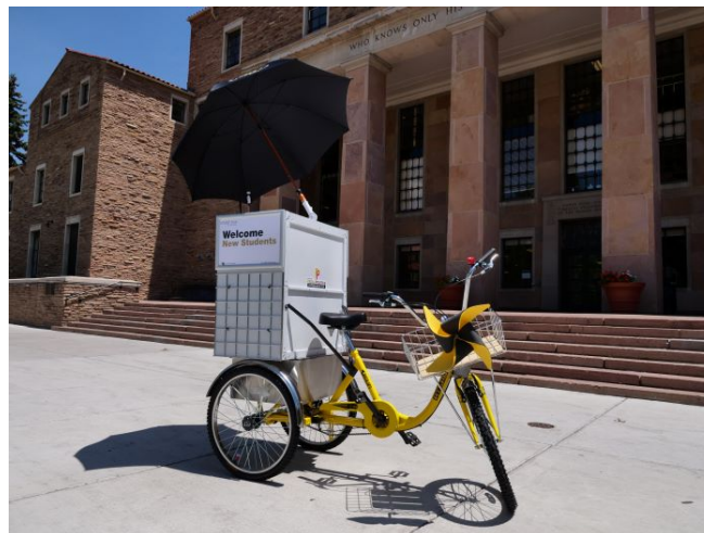
Figure 1: InfoMotion posed in front of Norlin Library at the University of Colorado Boulder.

While academic libraries strive to meaningfully engage their campus communities, it can be hard to imagine new and creative outreach strategies. InfoMotion, a customized tricycle, is the University of Colorado Boulder Libraries' "vehicle" to meet patrons where they are and embed ourselves in the campus community (Figure 1). InfoMotion was mobile and eye-catching, but it was cumbersome as we navigated campus pathways. The authors discuss their institutional context and describe an impactful partnership with engineering students to design an electric-assist system for InfoMotion. This collaboration resulted in a more user-friendly way for Libraries personnel to engage with the campus community, and helped the authors learn about student information needs while building relationships with engineering faculty and students.