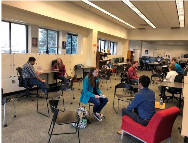
Figure 1. Students talk with practicing engineers during the Engineer Library Event at the Gemmill Engineering, Math & Physics Library.

Eight professional engineers were welcomed to the Gemmill Engineering, Math & Physics Library at CU Boulder with parking vouchers and catered sandwiches for lunch. The engineers represented most disciplines within engineering, as well as female engineers and ethnic/racial minorities. The engineers were seated in chairs that were grouped casually around the library (Figure 1).