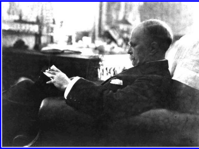
Fig. 1. Sir William Osler, 1849–1919.

secondary works on the history of medicine. His collection also contained books showing the relationship between medicine as art and medicine as science and contained a sizable section of books on medicine in literature.