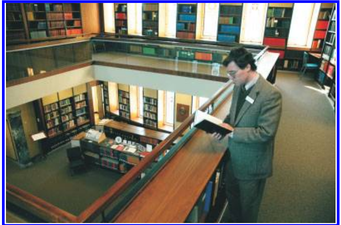
Fig. 2. Mezzanine of the Osler Library of the History of Medicine, McGill University.

placed. The library opened, amid a great deal of pomp and ceremony, in 1929. In his biography of Osler, Canadian historian Michael Bliss has described the Osler Room as "a shrine, architecturally a cross between a church and a mausoleum."