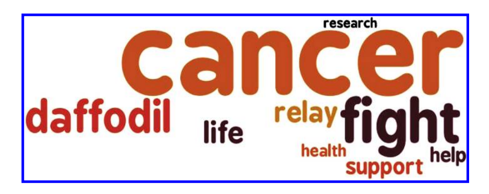
Fig. 1. Word cloud of frequently occurring terms in CCS tweets.

The different types of cancer are also underplayed, with the exception of breast (85), which is linked to health promotion messages about breast screening and mammograms (25), and an event, thingmaboob (32). Word occurrences for common types of cancer are lung (24), colon (22), prostate (22), skin (24), while other types of cancer merit less than 10 word occurrences. It seems plausible that there is a deliberate avoidance of negative terms in the tweets from the CCS twitter feed. Of interest to information professionals, there are 36 occurrences of the word "information", 16 occurrences of the word "resource", and nine occurrences of the cancer helpline phone number, 1-888-939-3333, in CCS tweets.