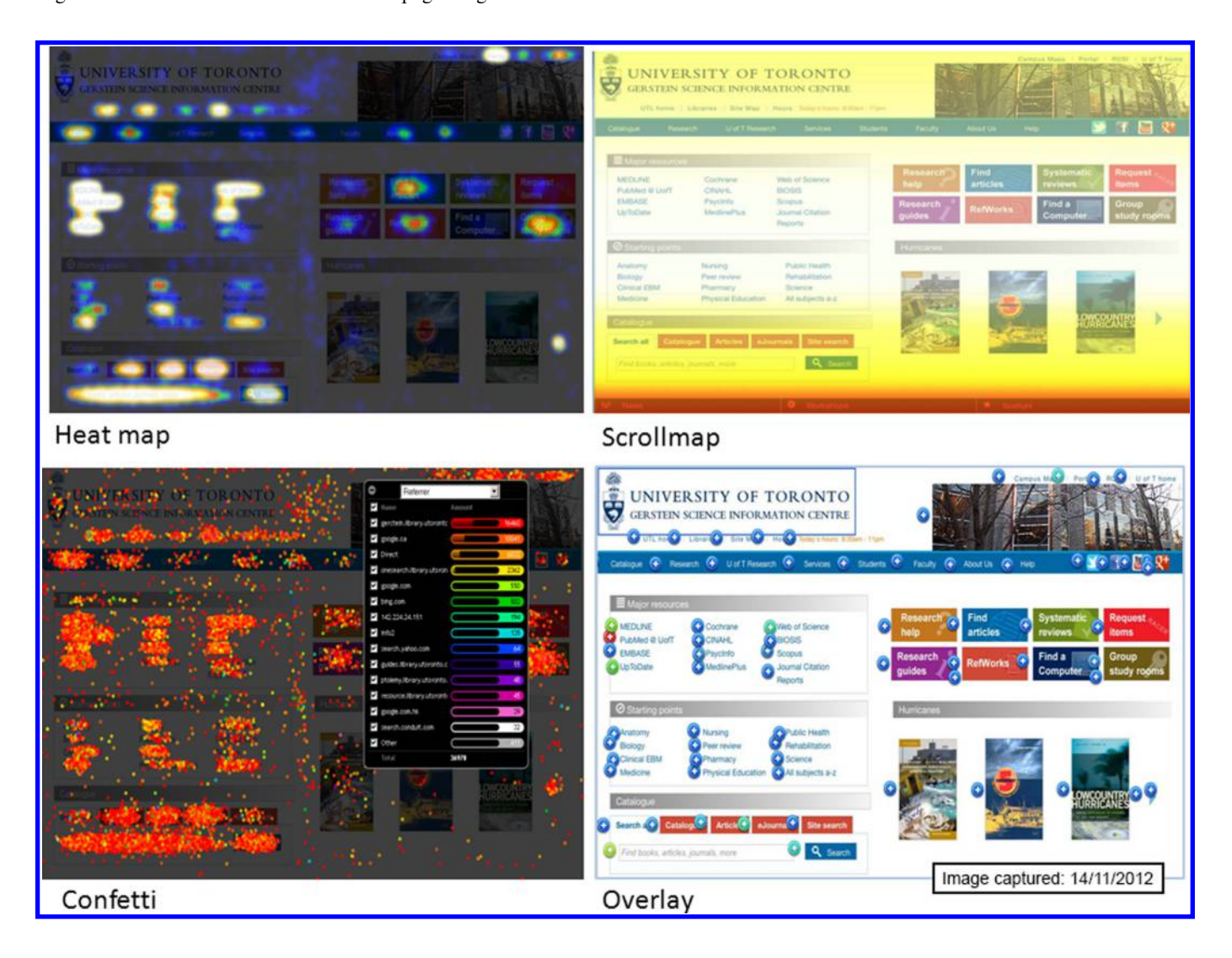
Fig. 1. Four visualization formats of web page usage.

that patrons are finding the hours link, and that it has not been lost in "banner blindness." As the academic year draws to a close, the usage of the link drops significantly, most likely because patrons have become familiar with our library hours.