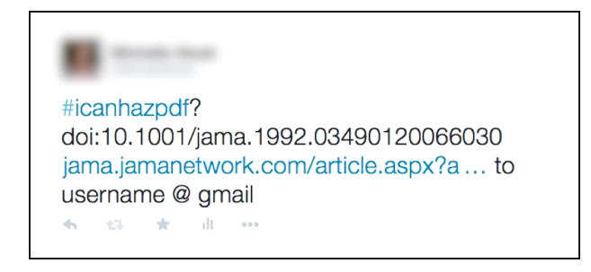
Fig. 1. Sample tweet.

San Francisco-based cognitive scientist Andrea Kuszewski first conceived of the #icanhazpdf hashtag in 2011 [9]. According to #icanhazpdf protocol, article requestors compose a tweet containing article information, their personal email address, and the #icanhazpdf hashtag (Figure 1). Other Twitter users fulfill requests by searching Twitter for the #icanhazpdf hashtag, accessing requested articles through institutional or personal subscriptions, and then emailing the article to the requestor. Once the request has been fulfilled, the requestor deletes the tweet. This procedure maintains anonymity for the article provider as he or she may infringe copyright or be in violation of licensing agreements.