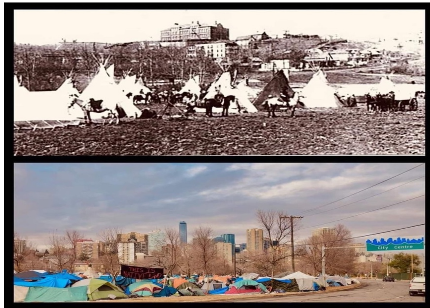
Figure 1: Indians' encampment on Rossdale Flats at foot of McKay Avenue School in Edmonton circa early 1900s.

Note (circa 1900s). Edmonton Maps Heritage.