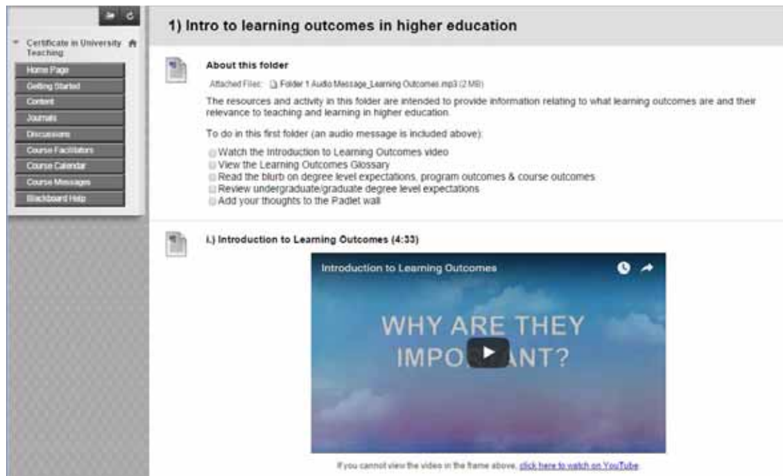
Figure 3: Screenshot: CUT learning module.