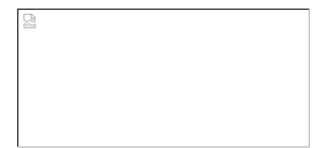
Figure 1: Traditional Schooling

"I was disappointed in the attitude of some of those I dealt with in administration who would rather 'deal' with me than 'relate' with me."