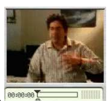
Figure 6: Douglas Lenat

[...] As the end of the class approaches, we pack up our dissection equipment, and return the pig's body to a plastic bag to prevent it from drying out. On my way out, the biology teacher takes me to one side, and says: "Norm, I noticed that you seemed to be having a difficult time at