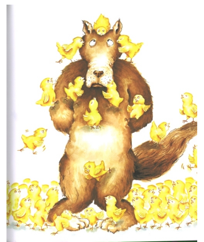
Figure 4. Image 16B in Both Versions of The Wolf's Chicken Stew

Importance of items in images. The data further show that not all items in an image were equally important. What children looked at in images was not random, but focused on specific things. About half of the image fixations within the narrative (47.8% and 55.2%) focused on the anthropomorphic characters in the story (the wolf, the chicken, the chicks). Thus in Image 1, which depicts the wolf sitting at a table eating, 63% of the fixations are on the wolf, and, in Image 3A/B, depicting the wolf creeping up on the chicken, 87.1% of the fixations are on the wolf and the chicken.