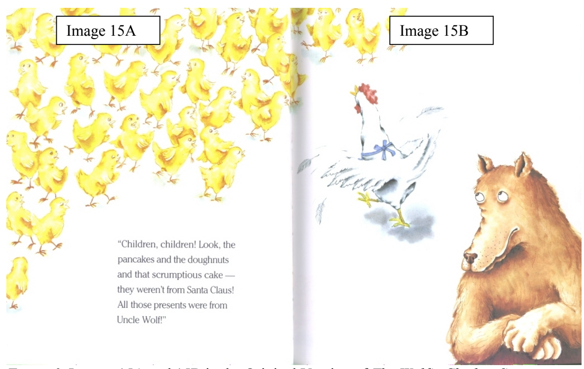
Figure 3. Images 15A and 15B in the Original Version of The Wolf's Chicken Stew

Availability of images. Availability of images was another factor related to children's use of images. When content was not available because images were deleted, the use of related images was affected. This was seen with the use of Image 12B previously discussed, and it also occurred with Images 15A, 15B, and 16B. In the original version of the story, the double page spread (Images 15A and 15B) provides the first view of the baby chicks which are shown in the top 2/3 of Image 15A (Figure 3). Image 15B shows the chicken facing the chicks with her beak open as if talking to the chicks, and the wolf with a sheepish look on his face.