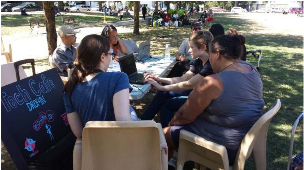
Figure 3. Tech café drop-in at Oppenheimer Park, Downtown Vancouver.

helped those who visited the table. The team focused on relationship building and timely, one-to-one digital literacy mentorship based on what people wanted to learn, stretching this into explorations of new digital terrains and skills. It was in these tech cafés that team members noticed persistent digital literacy trouble spots (such as passwords, accounts, and government forms) and gained further insight into how people used and responded to the LinkVan interface.