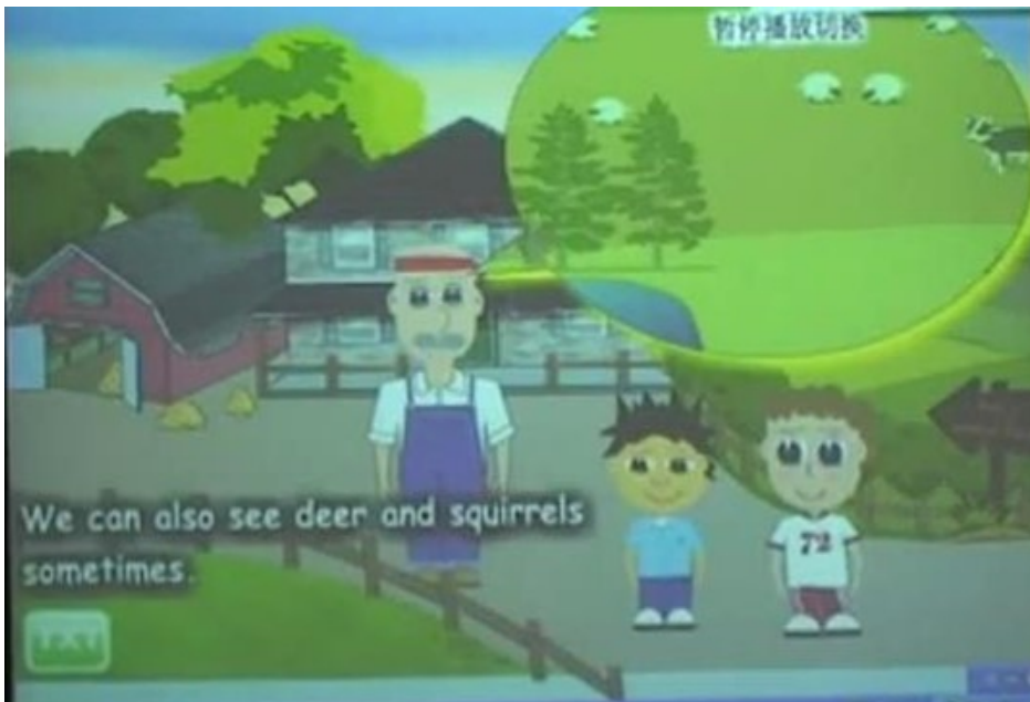
Figure 1. Example of computer-mediated multimedia courseware program during technology-enhanced instruction.