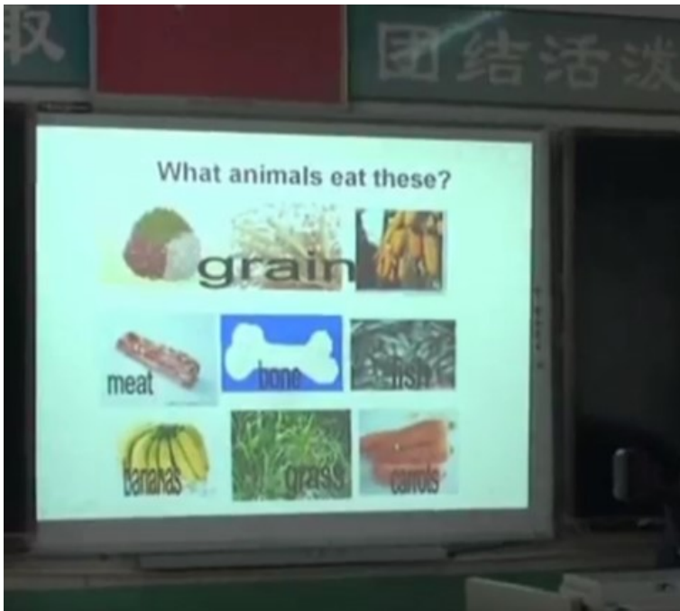
Figure 2. Example of a teacher self-made PowerPoint (PPT) slide during technology-enhanced instruction.