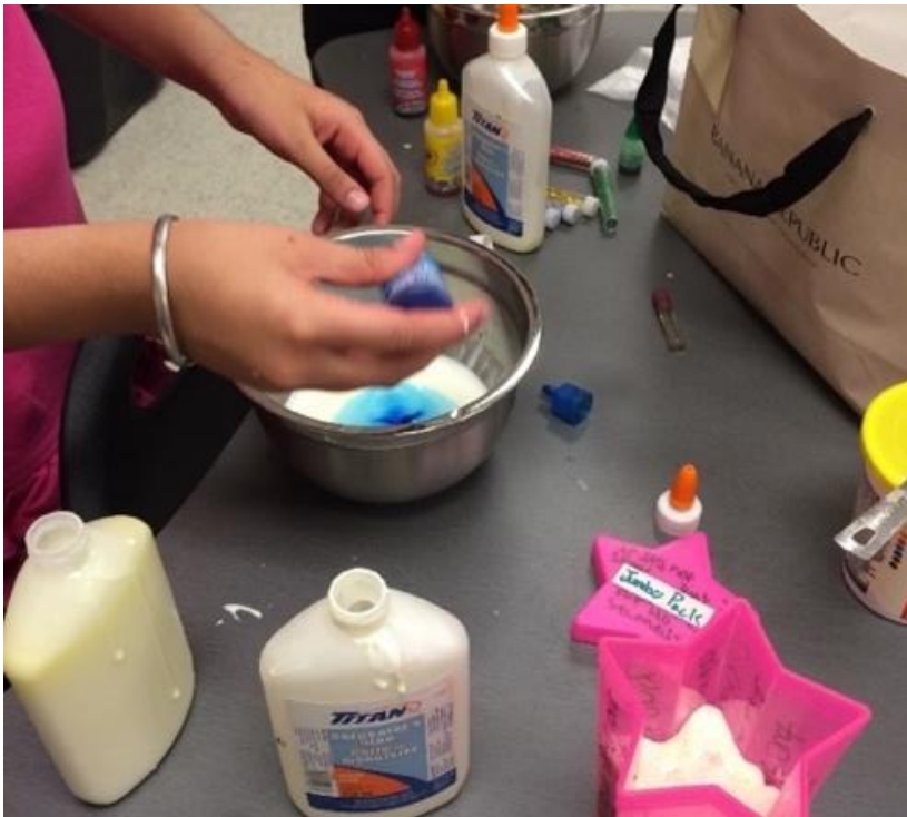
Figure 2. Making Silly Putty