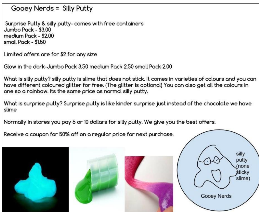
Figure 4. Gooley Nerds Advertisement

Figure 4 shows a business advertisement that the girls created; one of the assignment requirements Miss Green gave her students was to create an information poster. This image is significant because of how the girls used a register appropriate for the purpose. Phrases such as “limited offers for $2 for any size,” “it comes in a variety of colours and you can have a different coloured glitter for free,” and “receive a coupon for 50% off on a regular price for next purchase” demonstrate how the girls were familiar with the register appropriate in sales; this was part of the girls’ known . The girls also created a business slogan, “silly putty [none sticky slime]” and a company name “Gooley Nerds.”