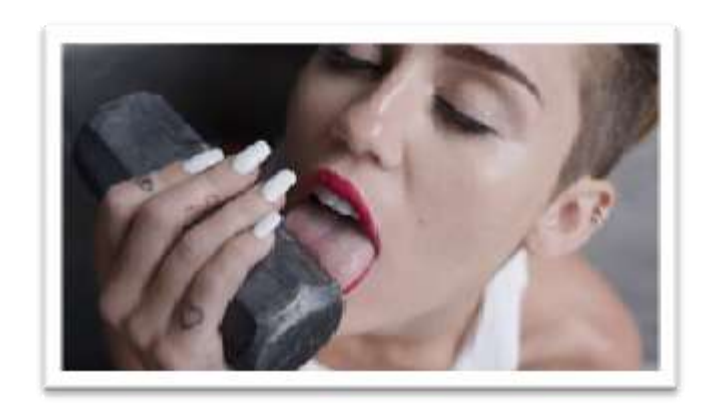
Figure 3: Screenshot from Miley Cyrus' "Wrecking Ball." Cyrus, Miley. "Wrecking Ball." YouTube . 9 September 2013. Web. 24 October 2014. <a href="http://www.youtube.com/watch?v=My2FRPA3Gf8">http://www.youtube.com/watch?v=My2FRPA3Gf8</a>>.

The video for "Wrecking Ball" was released on September 9, 2013. It was declared the most popular video of 2013 by the music website Vevo which hosts the clip (news.com.au) and by April 2015, more than 760 million viewers had seen the video. As mentioned above, in contrast to the low-key approach The Julie Ruin had chosen, the video's