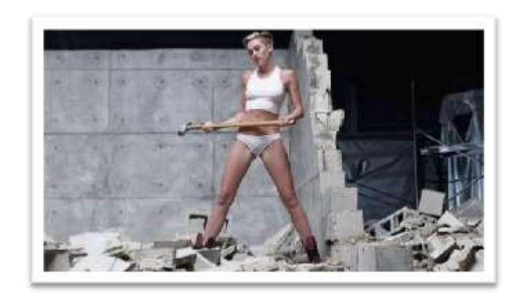
Figure 7: Screenshot from Miley Cyrus' "Wrecking Ball." Cyrus, Miley. "Wrecking Ball." YouTube . 9 September 2013. Web. 24 October 2014. <a href="http://www.youtube.com/watch?v=My2FRPA3Gf8">http://www.youtube.com/watch?v=My2FRPA3Gf8</a>>.

The moment Cyrus declares or even only perceives the display of a young nude female body as an act of empowerment — and empowerment certainly is a desirable project — the mechanism of cruel optimism goes into effect and renders this desirable object or condition impossible to obtain. In their analysis of "Awkwardness als Provokation" ("awkwardness as provocation")<sup>11</sup>, Carrie Smith-Prei and Maria Stehle go one step further and apply the term cruel optimism to the political project of feminism itself: "Die Fragen nach der feministischen Politik fallen in den Bereich des grausamen Optimismus. Feminismus, so unsere These, operiert selbst als grausamer Optimismus" ("Questions of feminist politics fall within the scope of cruel optimism . We argue that feminism itself operates as cruel optimism ", Smith-Prei and Stehle 5).) This assertion appears all the more productive when considering that Cyrus