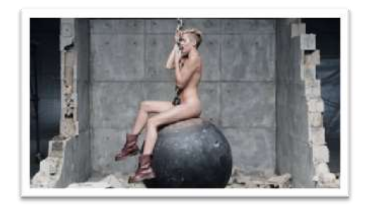
Figure 2: Screenshot from Miley Cyrus' "Wrecking Ball." Cyrus, Miley. "Wrecking Ball." YouTube . 9 September 2013. Web. 24 October 2014. <a href="http://www.youtube.com/watch?v=My2FRPA3Gf8">http://www.youtube.com/watch?v=My2FRPA3Gf8</a>>.

When The Julie Ruin's debut album Run Fast was released in September 2013, one month after the premiere of "Oh Come On," mainstream media attention shifted towards another video. More than one million people gathered in front of their TV sets, monitors, and displays to watch Miley Cyrus' "Wrecking Ball" (see fig. 2) which, in stark contrast to The Julie Ruin's low-key DIY-aesthetics, had a visual style more reminiscent of glossy fashion and lifestyle magazines like Vogue or Cosmopolitan . Comprised of shots of a lightly clad Miley Cyrus swinging on the eponymous wrecking ball through a stylized video set, the video provoked a significant, if short-lived, media scandal.