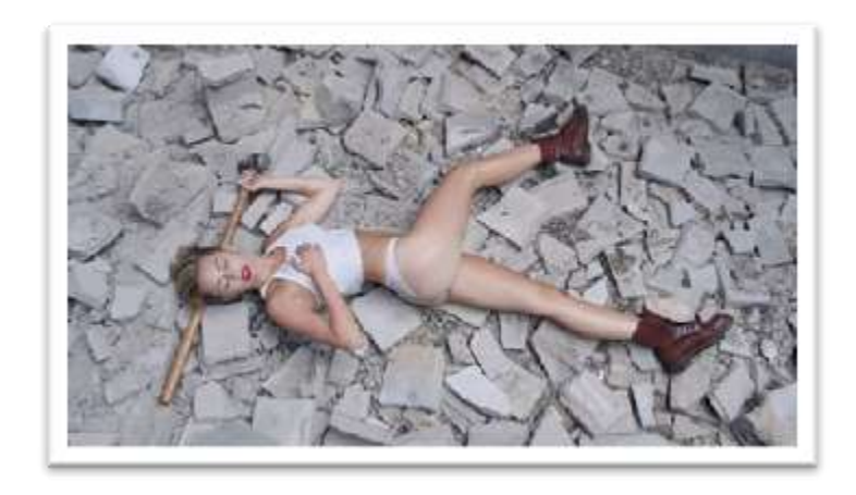
Figure 8: Screenshot from Miley Cyrus' "Wrecking Ball." Cyrus, Miley. "Wrecking Ball." YouTube . 9 September 2013. Web. 24 October 2014. <a href="http://www.youtube.com/watch?v=My2FRPA3Gf8">http://www.youtube.com/watch?v=My2FRPA3Gf8</a>>.

just wanted you to let me in / And instead of using force / I guess I should've let you win" as the expression of a distinctly feminist mindset. To use Berlant's terminology again, Cyrus' video proves to be cruelly optimistic in the sense that her attempts to make a feminist statement falls short due of her willingness to objectify her body without backing up potentially feminist visuals with corresponding content. Put differently, Cyrus stays on the surface of the skin without getting at the levels beneath.