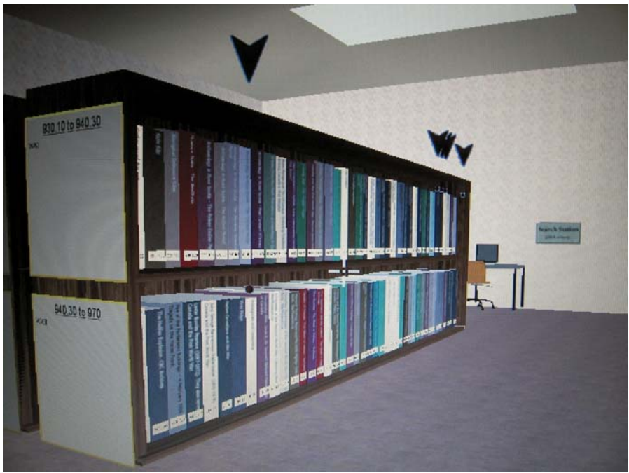
Figure 2. Classified books