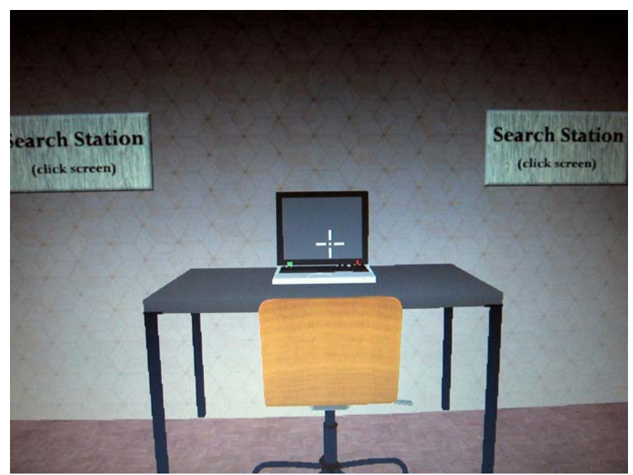
Figure 1. Search Station