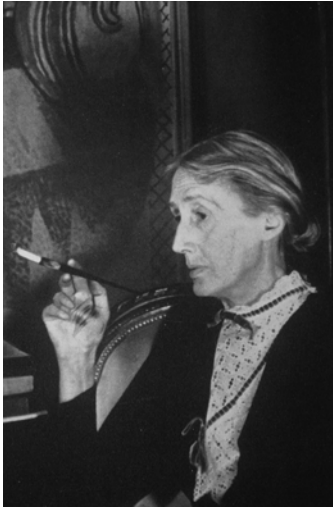
Virginia Woolf, 1941.

photographed for the very first time in his life. The face is in no way posed; it is absolutely unpolished.