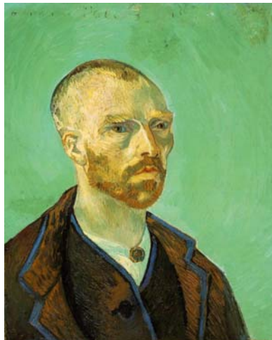
Vincent van Gogh, Self-Portrait Dedicated to Paul Gauguin, 1888.

The portraits of painters since around 1900, for instance, Van Gogh and Beckmann, are striking in a different sense. In Beckmann's 1901 self-portrait, the eyes almost become detached from the face. The glance of the painter has become the eyes of the viewer of the canvas. There seems to be a complete separation of self from the portrayed person. In the works of these painters, we witness the portrayal of a postmodern form of identity, which has often been related to the schizophrenic personality. The self, with all its problems (such as, the madness in Van Gogh), lies now completely on the surface of the face. We gain the impression that postmodern identity expresses itself in surface features, in a kind of outwardness or superficiality.