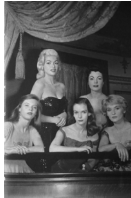
Shining Young Broadway Stars (1955). Cover image from Time Life Magazine 39(21).

We follow Van den Berg starting in the 1950's back through time. He sees the plurality of human existence reflected in the faces of five "Shining Young Broadway Stars" depicted on the cover photo of an issue of Time Life Magazine in 1955. Five young women's faces look at us from behind a balustrade. How do they look at us? No doubt that they expressly present themselves. But, in a way, they look less at us than at themselves: "Every face is defined by eyes which observe themselves through the lens. Every one of the girls is there as well as here ." By "here" Van den Berg means where the photographer was and where we are, as viewers, when we are looking at the picture. "Every one of the stars looks at herself through our eyes. As a result, everyone is present twofold. In manifold . For the 'here' is a manifold here " (Van den Berg 1974, p. 236).