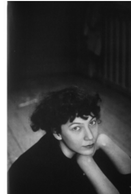
Johan van der Keuken, We are Seventeen (1955).

Another photograph of the same period shows what Van den Berg calls 'mild plurality'. A girl's face from a picture series of the Dutch photographer Johan van der Keuken entitled 'We are seventeen', which underlines the self-consciousness. The face is less overdone – less unbearable, as Van den Berg says – than the faces of the Broadway stars. The face is even kind, sensible and agreeable. But, that this face knows it is being looked at is undeniable. The spectators direct the plural face, says Van den Berg.