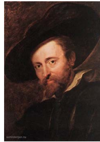
Peter Paul Rubens, self-portrait from between 1628-1630.