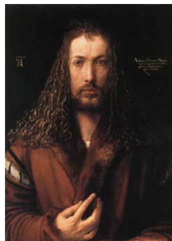
Albrecht Dürer, Self-Portrait in a Fur Collared Robe, 1500

What such paintings demonstrate is quite fascinating. When, for example, we regard the self-portrait by Albrecht Dürer from the year 1500, we see him portrayed as Christ in a fur coat. We could study the special blessing gesture Dürer's