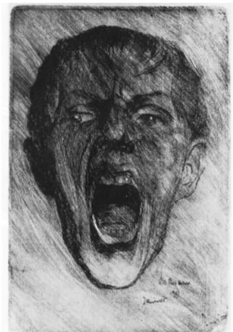
Max Beckmann, Self-Portrait, 1901.