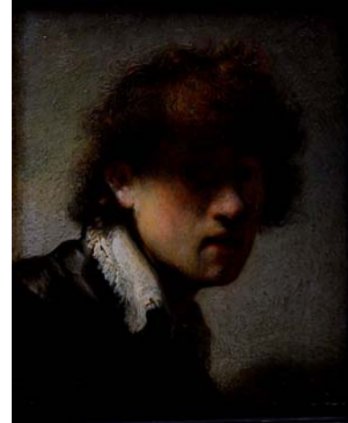
Rembrandt, Self-Portrait as a Young Man , 1629 (Wikimedia Commons).

This distance from the self is even more markedly visible in the self-portrait by the young Rembrandt of 1629. There is no social role identification or hiding behind a social image – all we see is Rembrandt himself, so to speak. In many of his other paintings Rembrandt does portray himself in certain roles, such as a biblical figure, but it is curious that, beside this "social role series", there exists also a "self-series" of Rembrandt portrait paintings. Now, what may strike us in the portrait of 1629 is the questioning glance of the 23-year old painter. His eyes are partially covered by shade, which emphasizes the separation between the private and the public sphere. This self-portrait acts as evidence that the human face conceals a secret. Why? Because Rembrandt seems to look at us from the deepest sanctuary of his inner self.