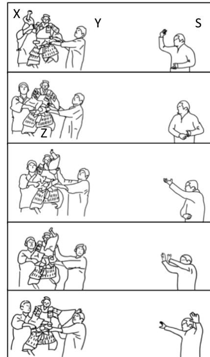
Figure 2: A part of the choreography

We can notice two types of miscommunication in the first part of this example. The first communication failure is at a more fundamental level and is caused by a gap in