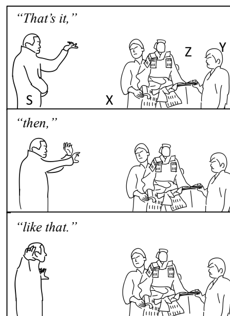
Figure 3: S's demonstration

Y, the puppeteer manipulating the puppet's left hand, causes the second miscommunication because he starts to move before X (Figure 2). Because he is concentrating so hard on his task of manipulating the left hand, he inadvertently follows S's demonstration of the choreography. This means that Y ignores the important rule that puppeteers must wait for a signal from the head, in this case from X. Therefore, if S were to advise them, he could tell Y to wait for X to move first. No one recognizes the miscommunication between the head and the left hand right away, however, because Y's movement is correct in appearance. This is also because S is so familiar with the choreography that his hands move almost automatically, and so he cannot understand the importance of the coordination with the left hand puppeteer. As a result, the new temporal relationship between Y and S confused X. This resulted in a miscommunication between X, Y, and S, none of whom shared their confusions with the others.