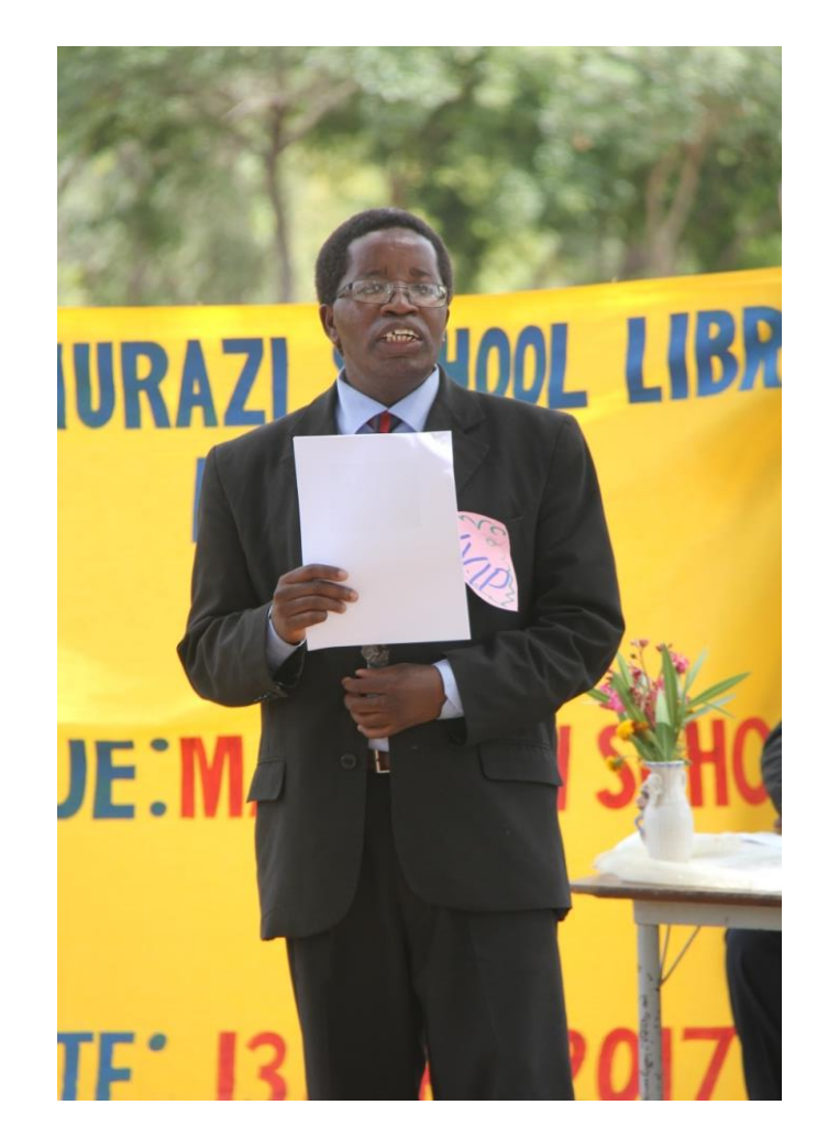
Book Mobilisation and Presentation at Mavhurazi School

schools and highlighting the School Library Committee as the backbone of a properly run school library and how the culture of reading would be encouraged in schools to help make the school library more effective in meeting the teaching and learning process, promoting the use of books, and ultimately the use of the library.