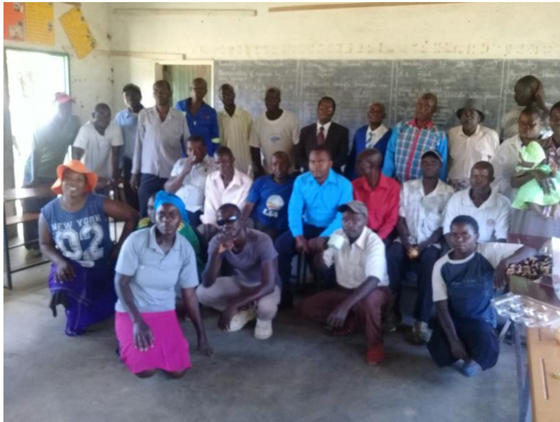
A Cluster Meeting of Schools in Mavhurazi

The case study however does not include programmes that promote reading culture or a regular means of inculcating reading culture into the students. No strategies such as story hour, book talks and displays for promoting reading culture are in place.