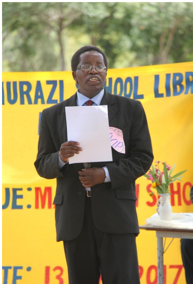
The author gives a speech during the Book Presentation at Mavhurazi School

It would be foolhardy to encourage the culture of reading in remote rural schools without ensuring the supply of the much needed books. It then took one month of intense preparation to organize the clearance of books from Australia and organize a Book Presentation Ceremony