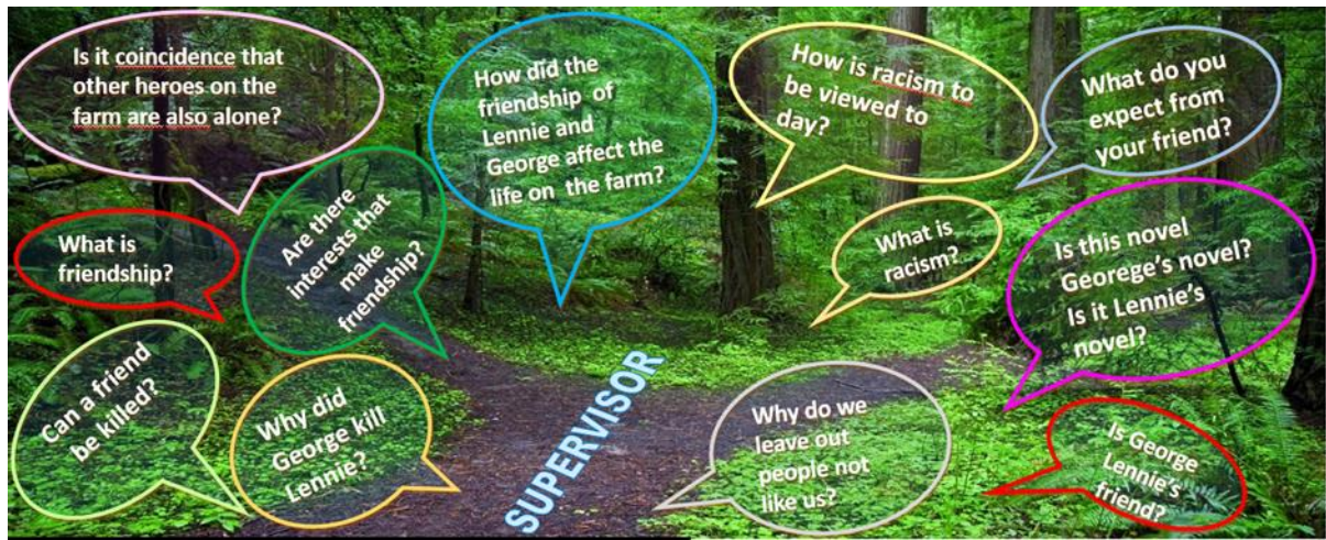
Figure 4: Of Mice and Man Supervisor Questions