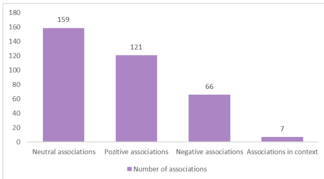
Graph 3: Types of associations of school librarians (N 122)

The third hypothesis (H3) was tested school librarians' belief that their professional public is not aware of the problems in their field. Respondents were asked to confirm which of the existing key problems they were familiar with. Several answers were possible.