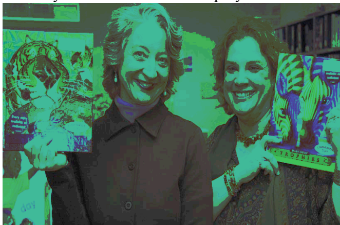
WKU ELALC-SEK project leaders with Trophies Curriculum Guide