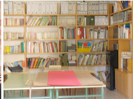
St. Julia school library