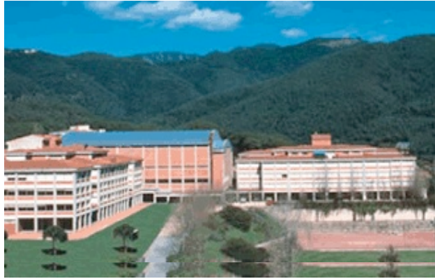
The SEK Catalunya Campus

The SEK Catalunya campus is one of eight P-12 schools in the SEK system. The SEK Catalunya markets itself as a progressive school, dedicated to developing the whole child through project addresses developmental and interests. The the International program at the and very recently version of this recognized degree Years or PYP committed to for a global development of multiple languages.