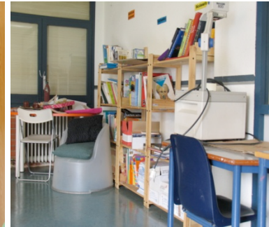
SEK primary grades library