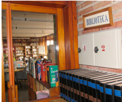
Garbi school library