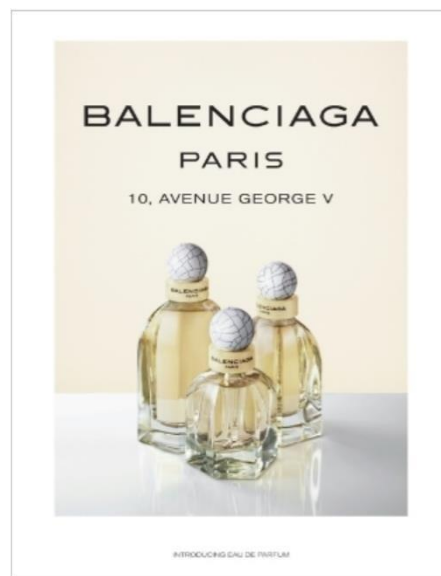
Fig. 1. The logo featured on the box for the fragrance Balenciaga Paris.

Balenciaga is one of Europe's most respected but also counterfeited luxury brands. The Basque designer Cristobal Balenciaga founded his fashion house in 1918 and went on to dress Spanish and Belgian queens, in addition to the twentieth century's most celebrated fashion icons. Balenciaga trained in Madrid but relocated to Paris after the outbreak of the Spanish Civil War and established himself as one of Paris's top couturiers. The couture house closed its doors in 1968, and the designer died in 1972. The house reopened as a ready-to-wear line in 1987. The French-born Nicolas Ghesquière became its creative director in 1997 and re-established Balenciaga as a consecrated brand ("Balenciaga"). In 2001, the Gucci Group, under the corporation Pinault-Printemps-Redoute (now called Kerig), acquired the fashion house. 6 The Balenciaga logo (there are different incarnations) lists the house's name under a mirrored letter "B" connected at the stem by three diagonal lines. "Paris" appears under the house name. The logo used for the C.O.I. t-shirt is printed onto the box that contains the fragrance "Balenciaga Paris": it includes the house name and the address of its Paris atelier ("Balenciaga Paris") (see fig. 1).