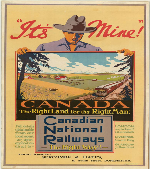
Figure 2 “It’s Mine” CANADA: The Right Land for the Rights Man: Canadian National Railways - The Right Way - ! (ID No 2905070)