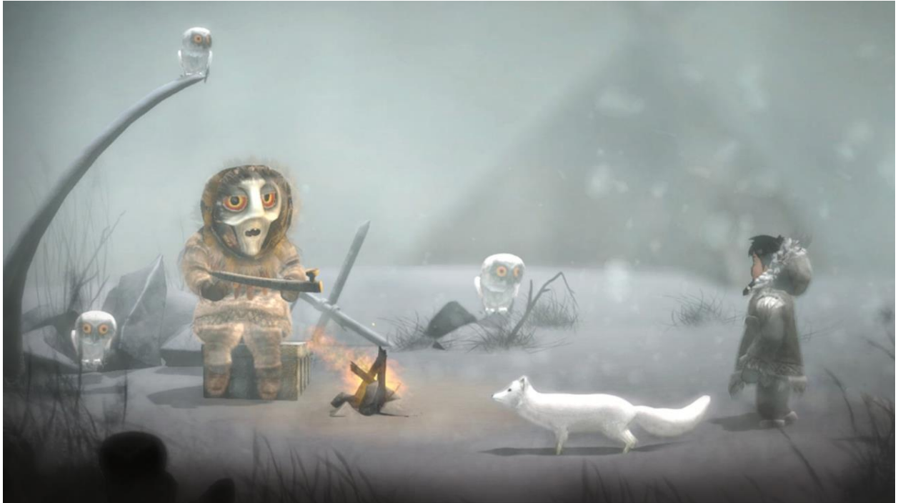
Figure 2. Never Alone – (Source: Steam, 2021).

about in the space instead of following linear directions along the map, they move along trails or follow rivers. This alternative form of placemaking critically emphasizes the difference between a settler colonial cartographic gaze and a defiant Indigenous one that goes against a Euro-western form of cartography that omits Indigenous Peoples, their communities, and their Land (Miner, 2020 p. 326).