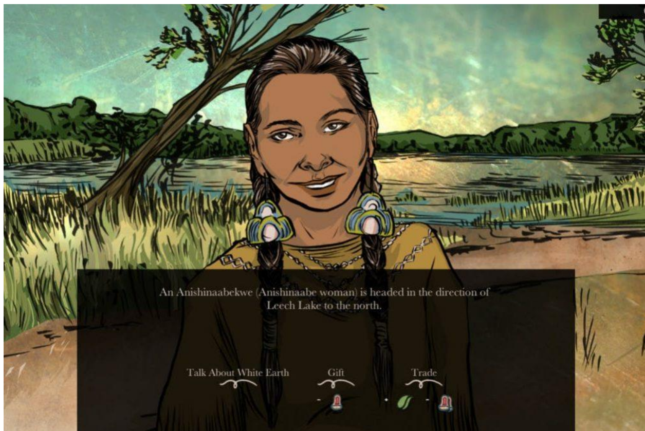
Figure 1. When Rivers Were Trails – (Source: Five Oaks Museum, 2021).

that stereotypes of Indigenous Peoples as guides, traders, or hostile attackers of precious settler wagons and lives are pervasive. Indigenous Peoples are woefully misrepresented in this form of digital media, as in many others. Other video games involve the subgenre strategy of 4X, or Explore, Expand, Exploit, and Exterminate (Hafer, 2018). Games such Europa Universalis and Civilization have players gather materials and living things such as wildlife, plants, berries, wood, rocks, metals, and other resources that are then used, traded, or sold to sustain a character's health points. Indigenous Relationality and histories and how Indigenous Peoples inform respectful approaches to the Land, animals, cultural objects, spirits, the air, and whole ecosystems are not considered. Prioritizing Indigenous voices in video games could instead add nuance to traditional game mechanics through the sharing of sacred and cultural stories that demonstrate respect and relationality to the Land.